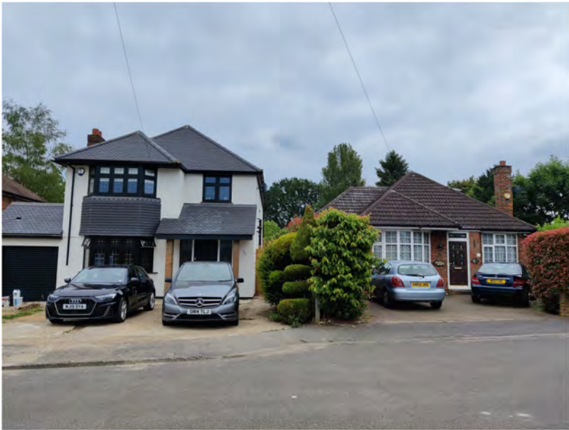
1. EXISTING SITE PHOTOGRAPH (FRONT ELEVATION)