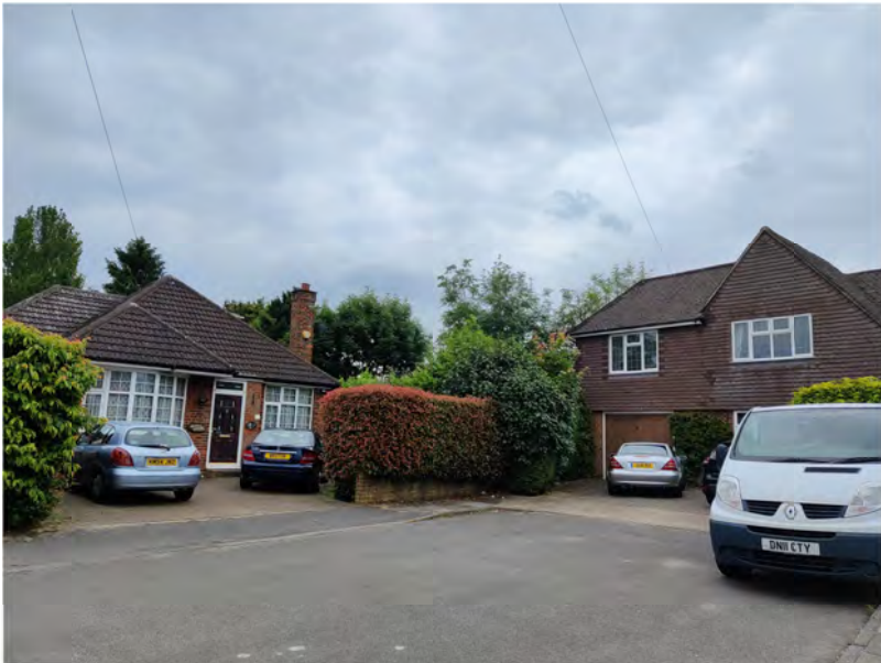
3. EXISTING SITE PHOTOGRAPH (FRONT ELEVATION)