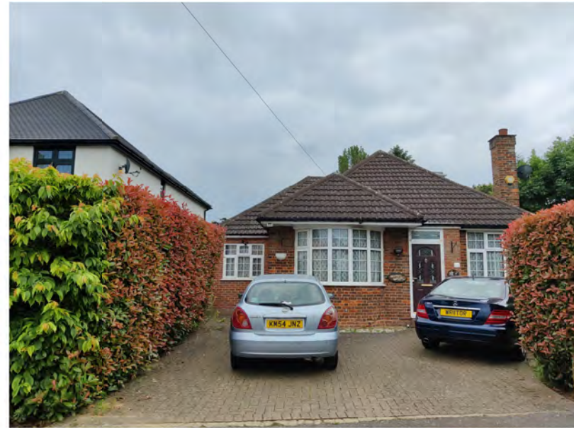
2. EXISTING SITE PHOTOGRAPH (FRONT ELEVATION)