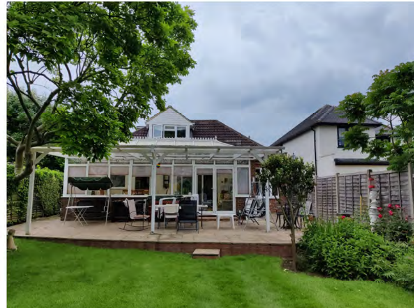
4. EXISTING SITE PHOTOGRAPH (REAR ELEVATION)