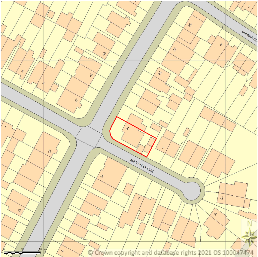
Location Plan@ 1:1250