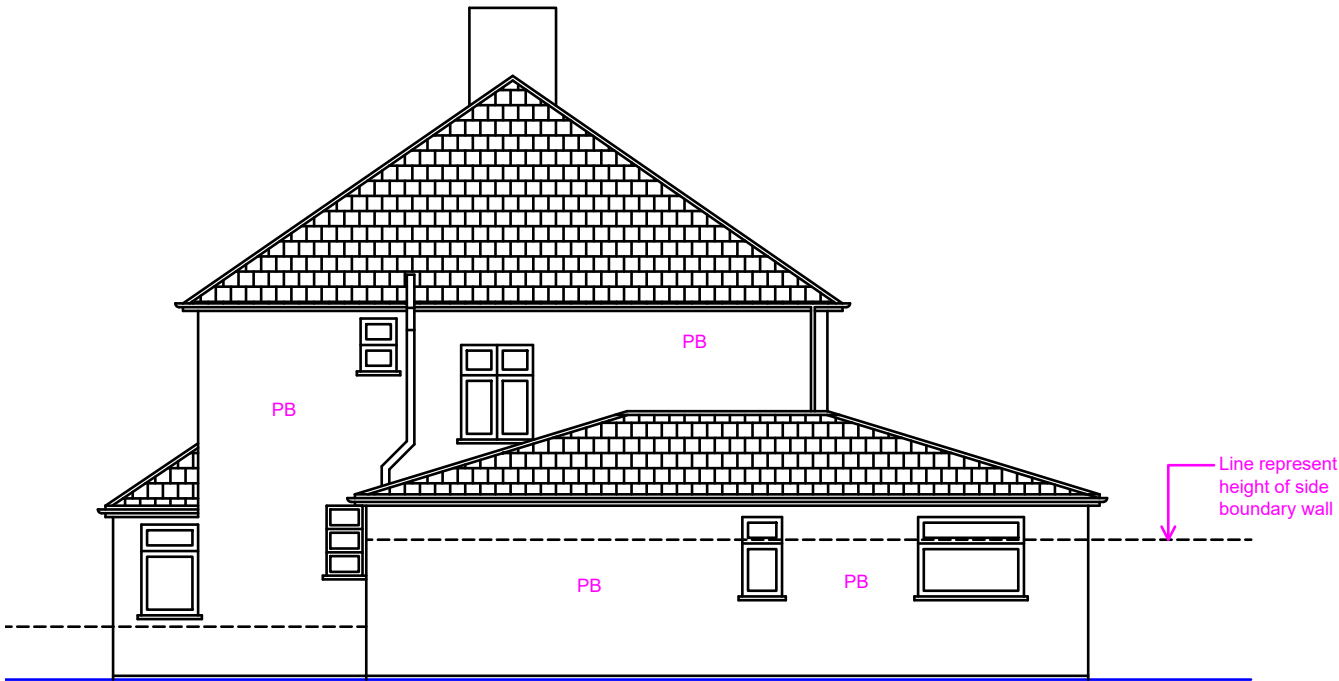
Existing Side Elevation (RHS)