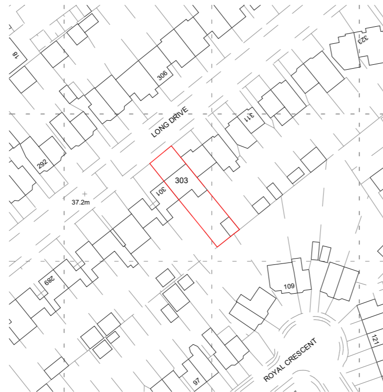
1 Location Plan 1:1250