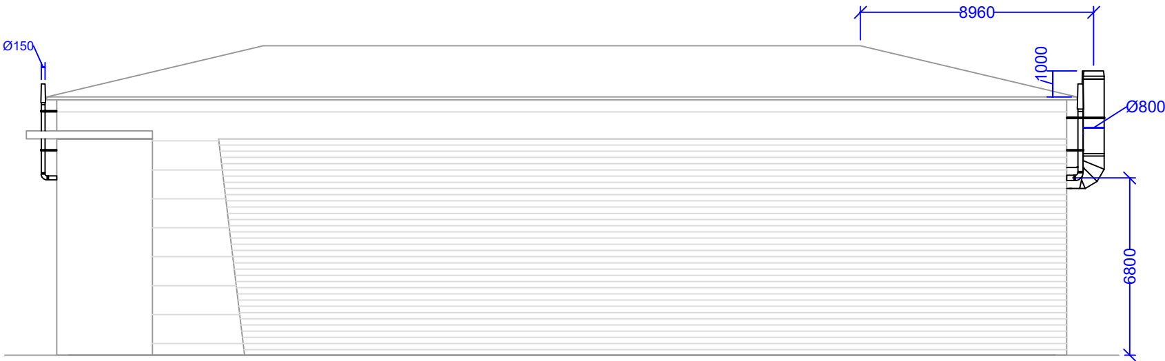
Proposed View On North Elevation