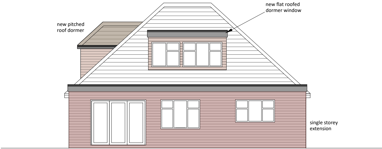
REAR ELEVATION - PROPOSED