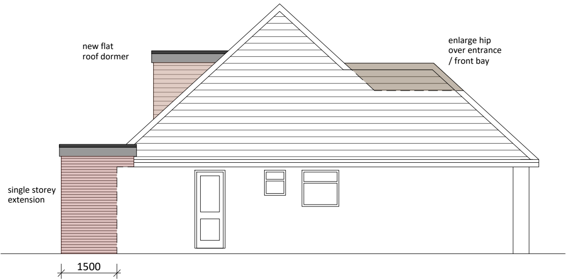
SIDE ELEVATION (WEST) - PROPOSED