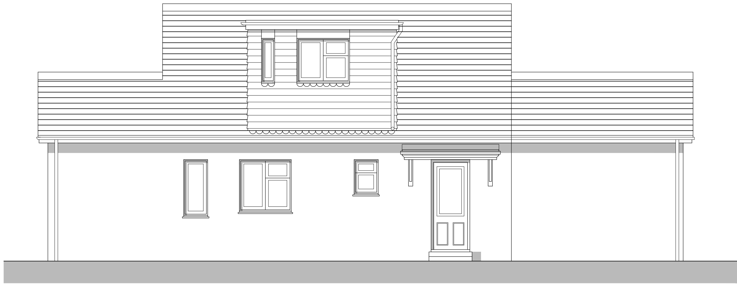
3 EXISTING SIDE ELEVATION 74 FERRERS AVENUE, WEST DRAYTON SCALE 1:50