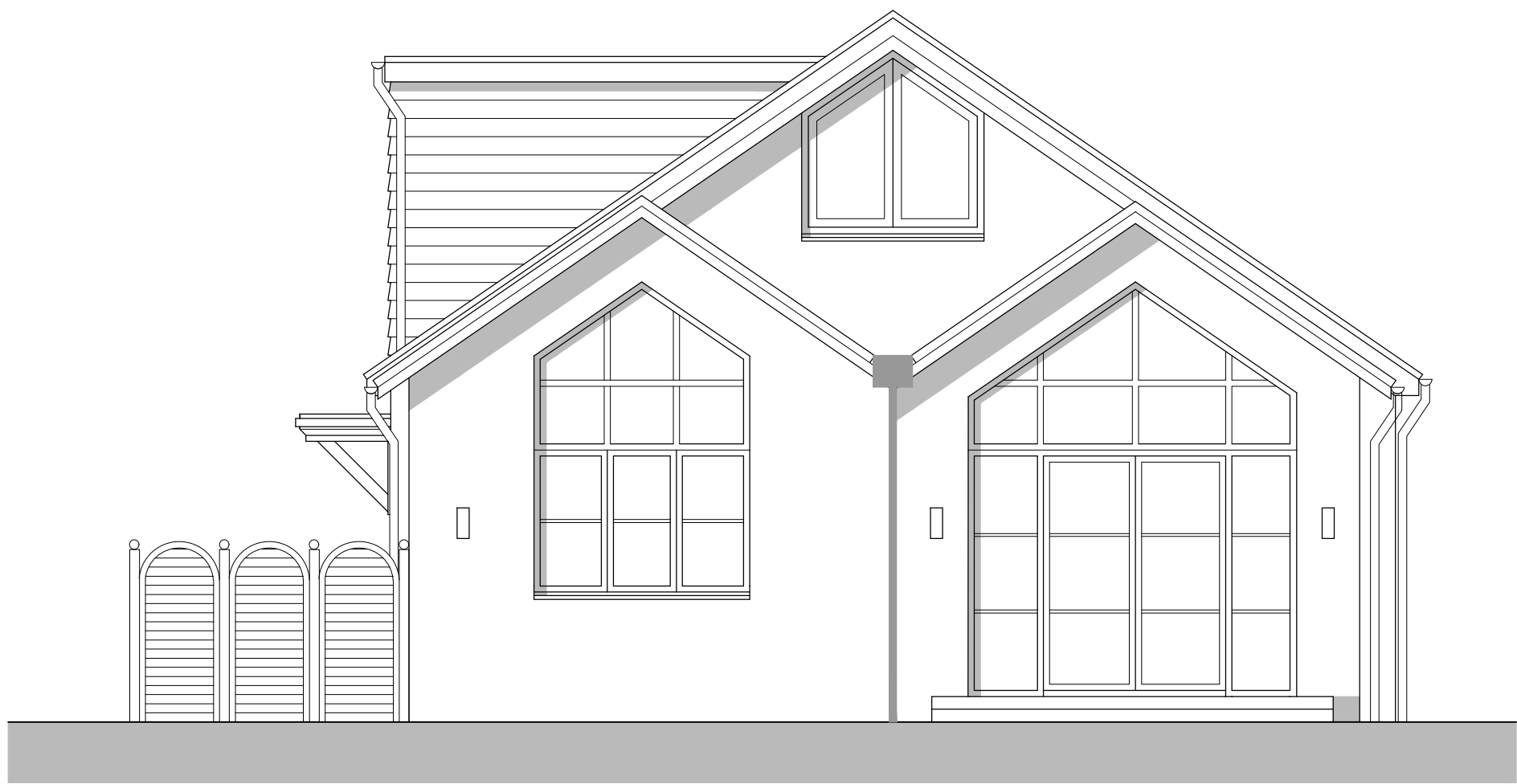
2 EXISTING REAR ELEVATION 74 FERRERS AVENUE, WEST DRAYTON SCALE 1:50