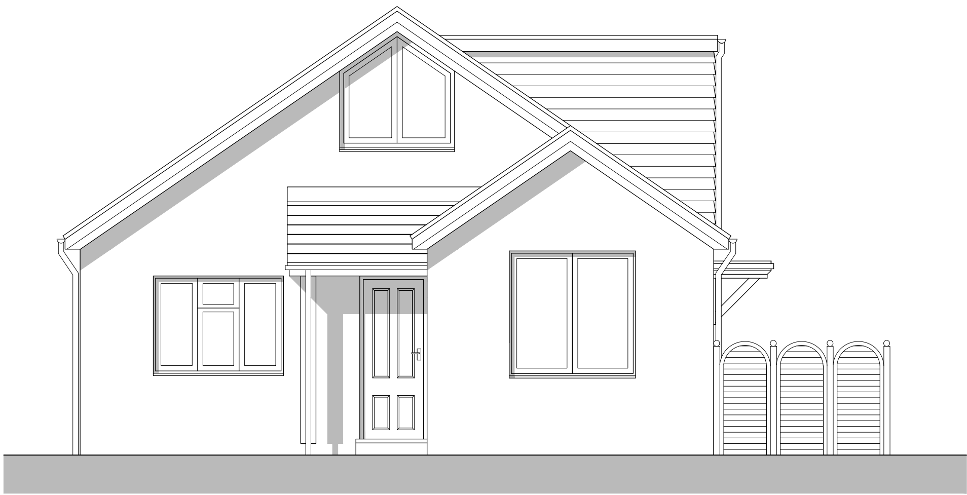
1 EXISTING FRONT ELEVATION 74 FERRERS AVENUE, WEST DRAYTON SCALE 1:50