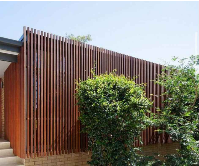
PRIVACY SCREEN - TIMBER SLATS WITH PLYWOOD BOARD ATTACHED TO REAR TO PREVENT OVERLOOKING