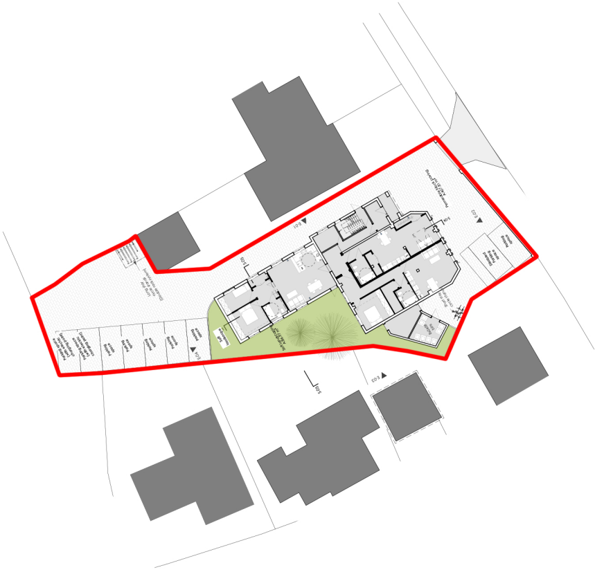
Creative Ideas & Architecture Office (2022). Proposed site plan, 03/10/22, DWG. 166-3GA-01A