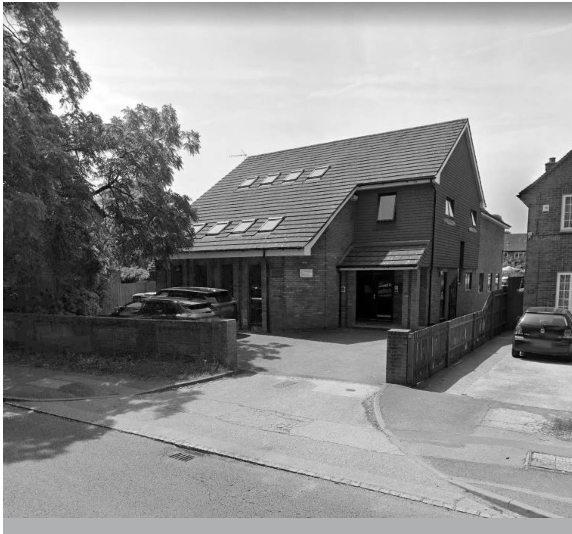
166 | FIRE SAFETY STRATEGY Haydon House, 296 Joel Street, HA5 2PY Westgold Holdings Ltd