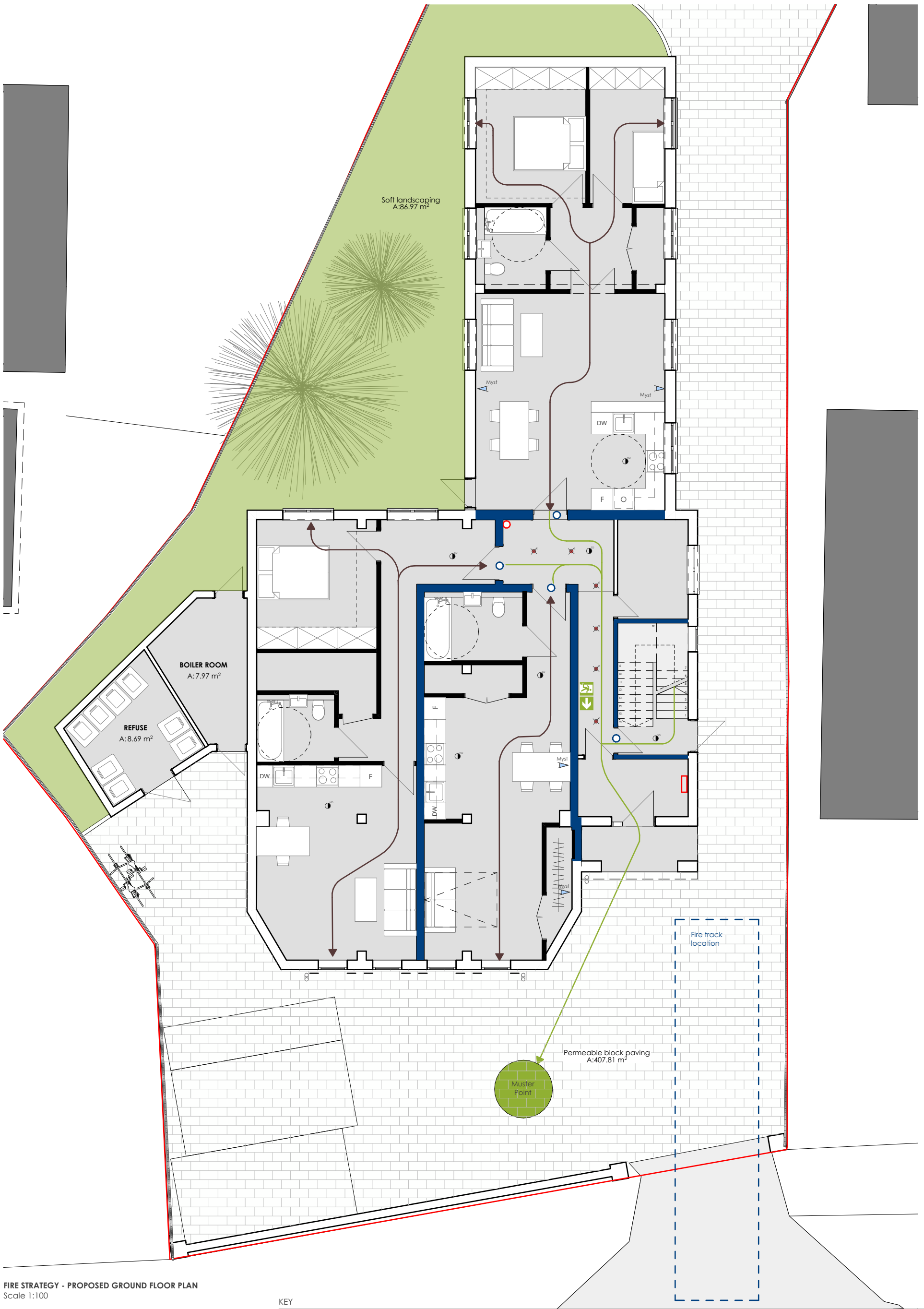
FIRE STRATEGY - PROPOSED GROUND FLOOR PLAN Scale 1:100