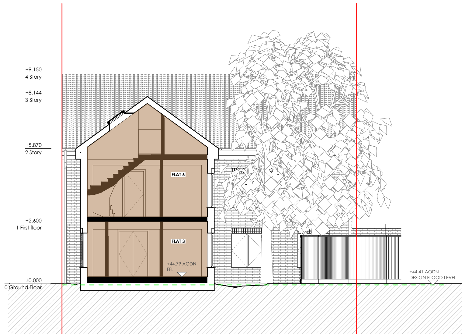
PROPOSED S-05 SECTION Scale 1:100