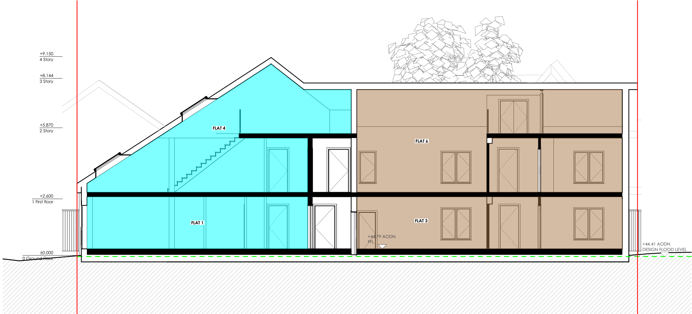
PROPOSED S-04 SECTION Scale 1:100