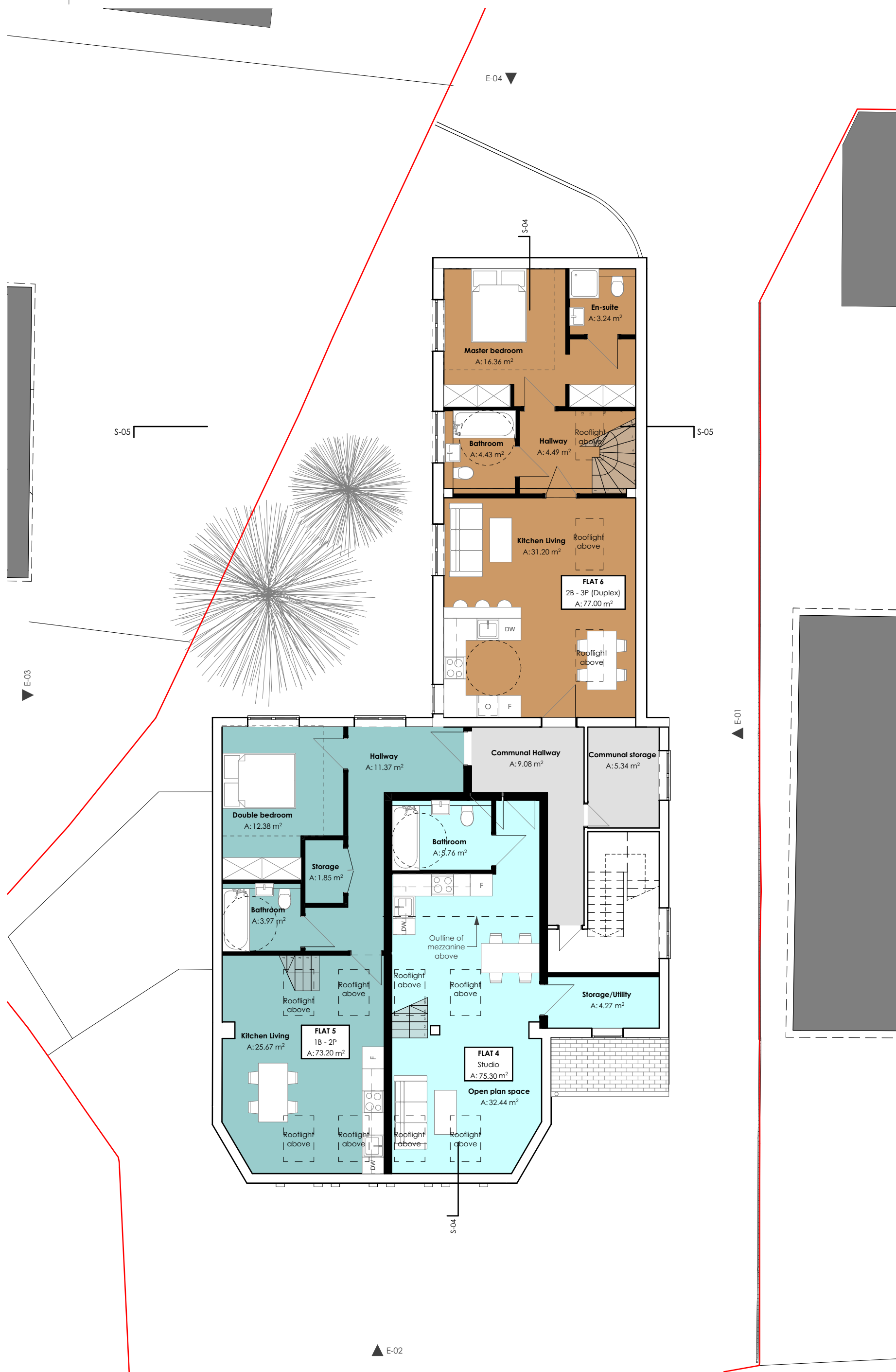
PROPOSED FIRST FLOOR PLAN Scale 1:100