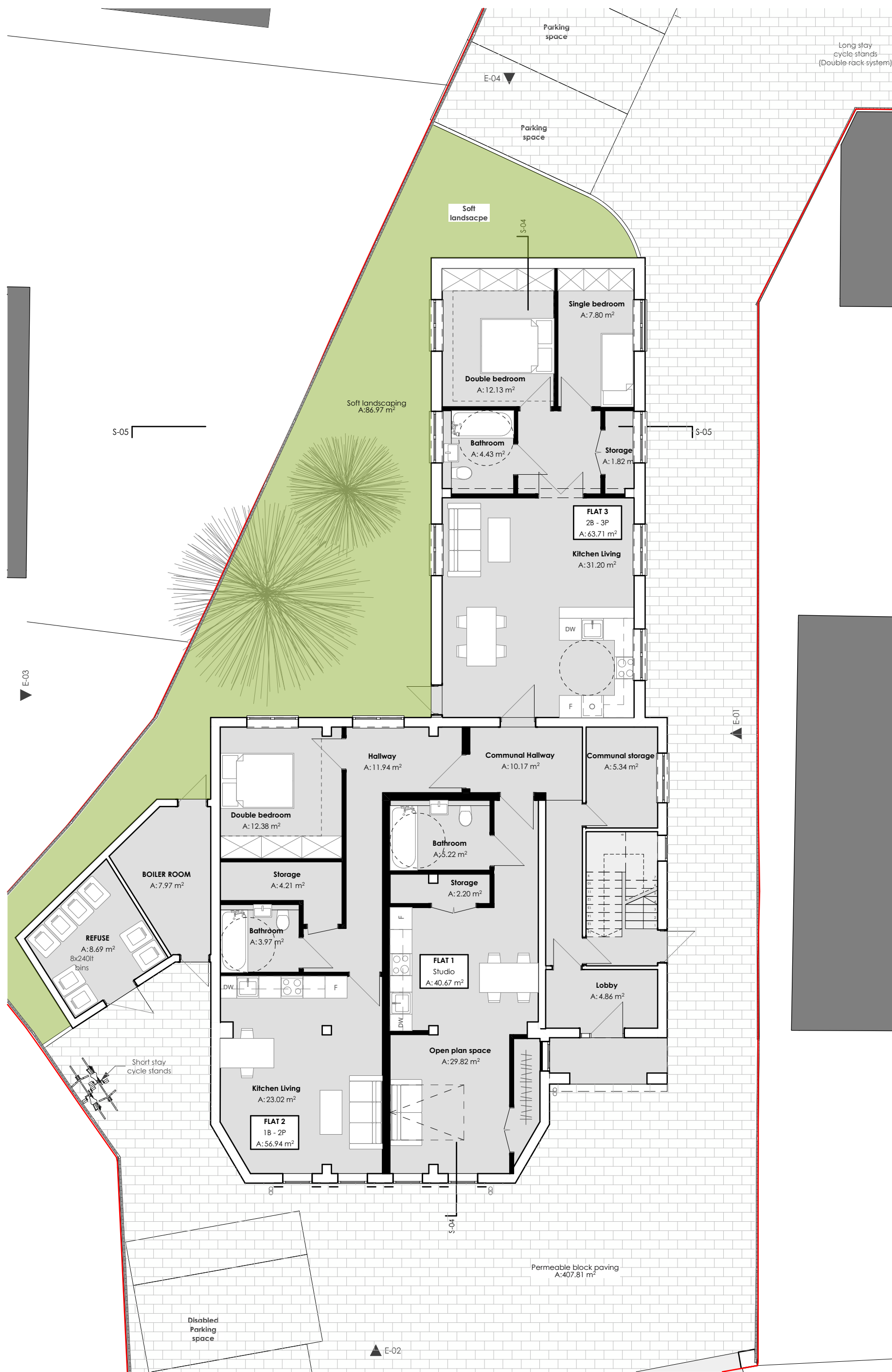
PROPOSED GROUND FLOOR PLAN Scale 1:100