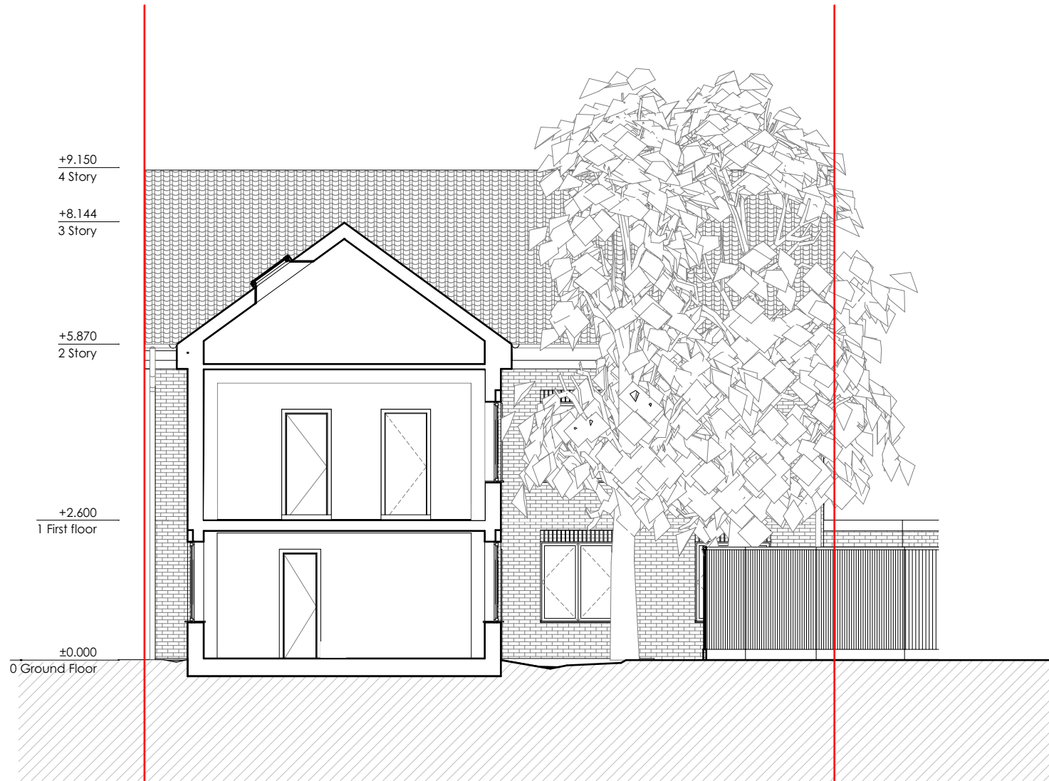
EXISTING S-05 SECTION Scale 1:100