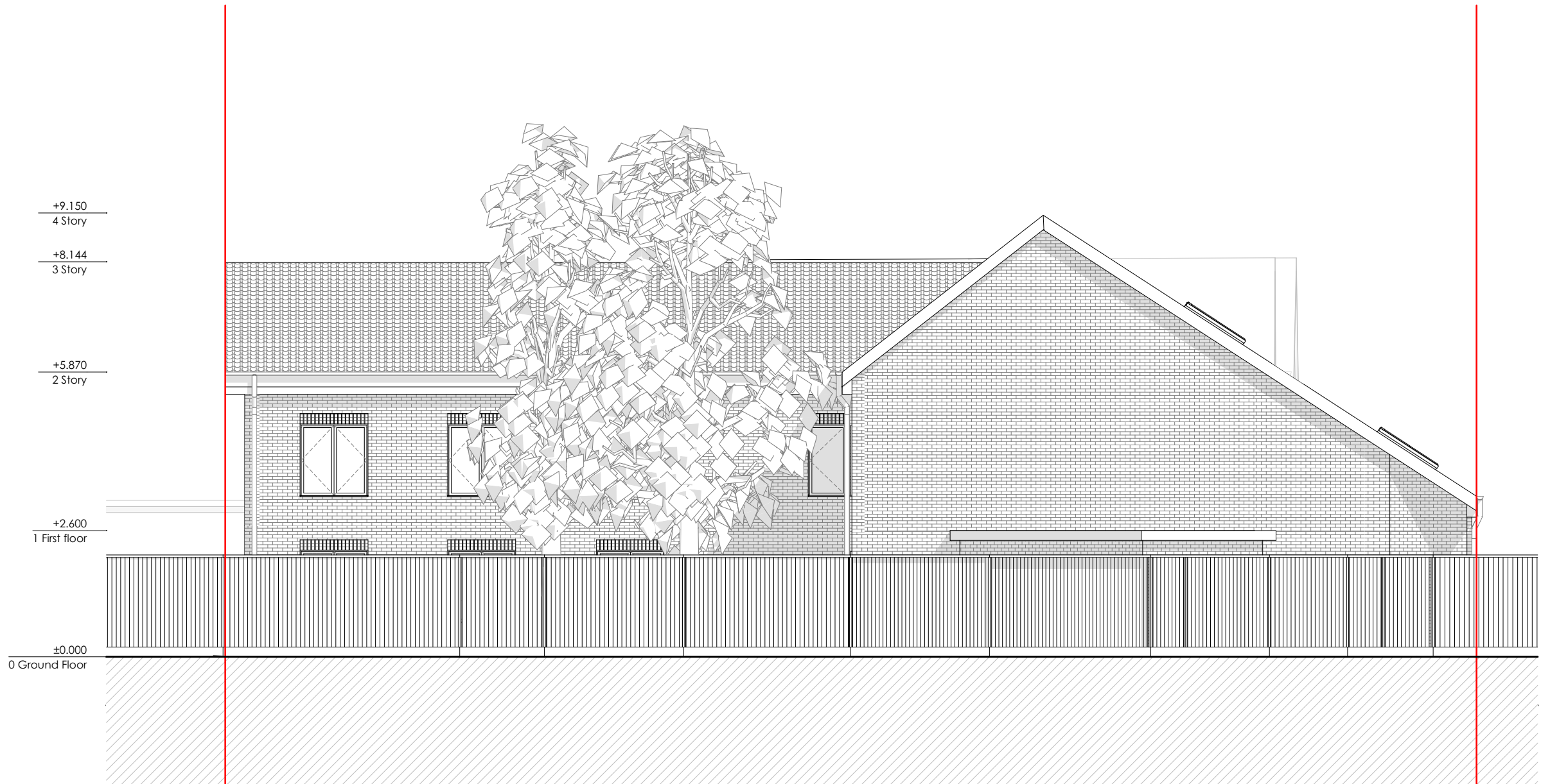
EXISTING WEST ELEVATION Scale 1:100