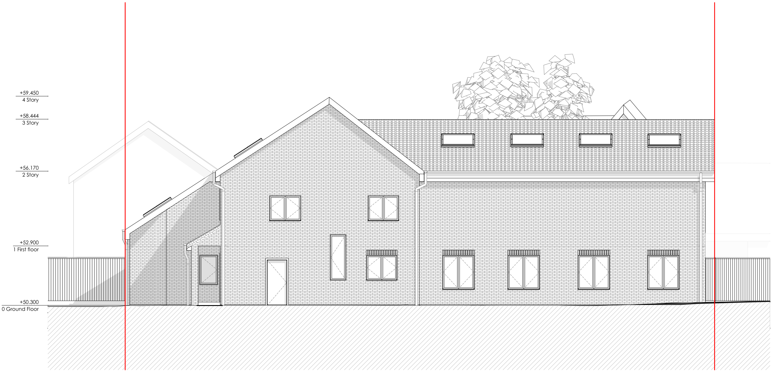
EXISTING EAST ELEVATION Scale 1:100