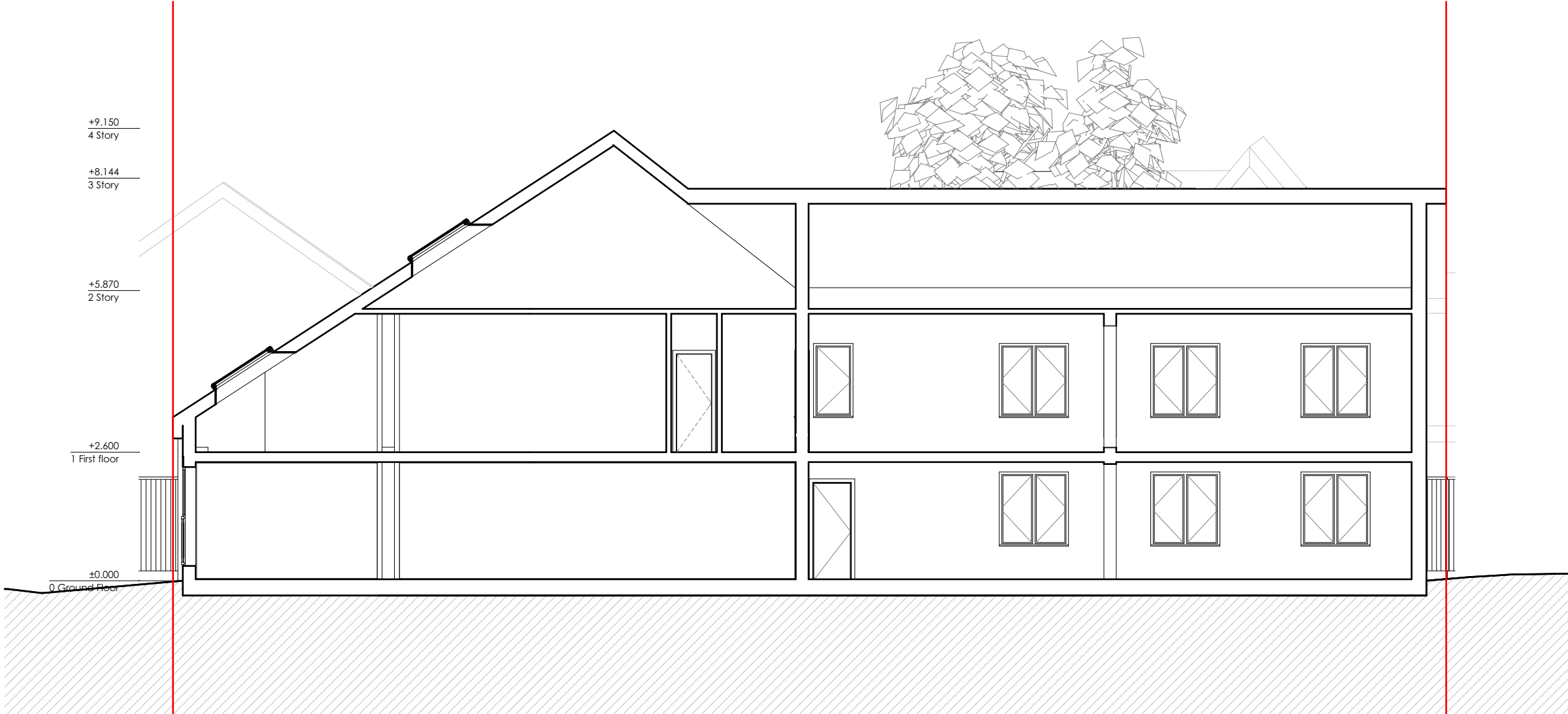
EXISTING S-04 SECTION Scale 1:100