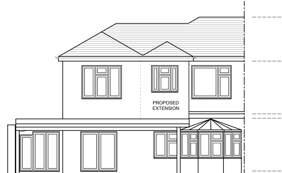
PROPOSED REAR ELEVATION SCALE= 1:100