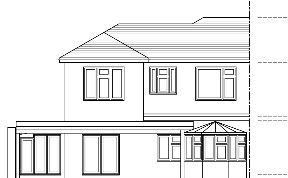
EXISTING REAR ELEVATION SCALE= 1:100