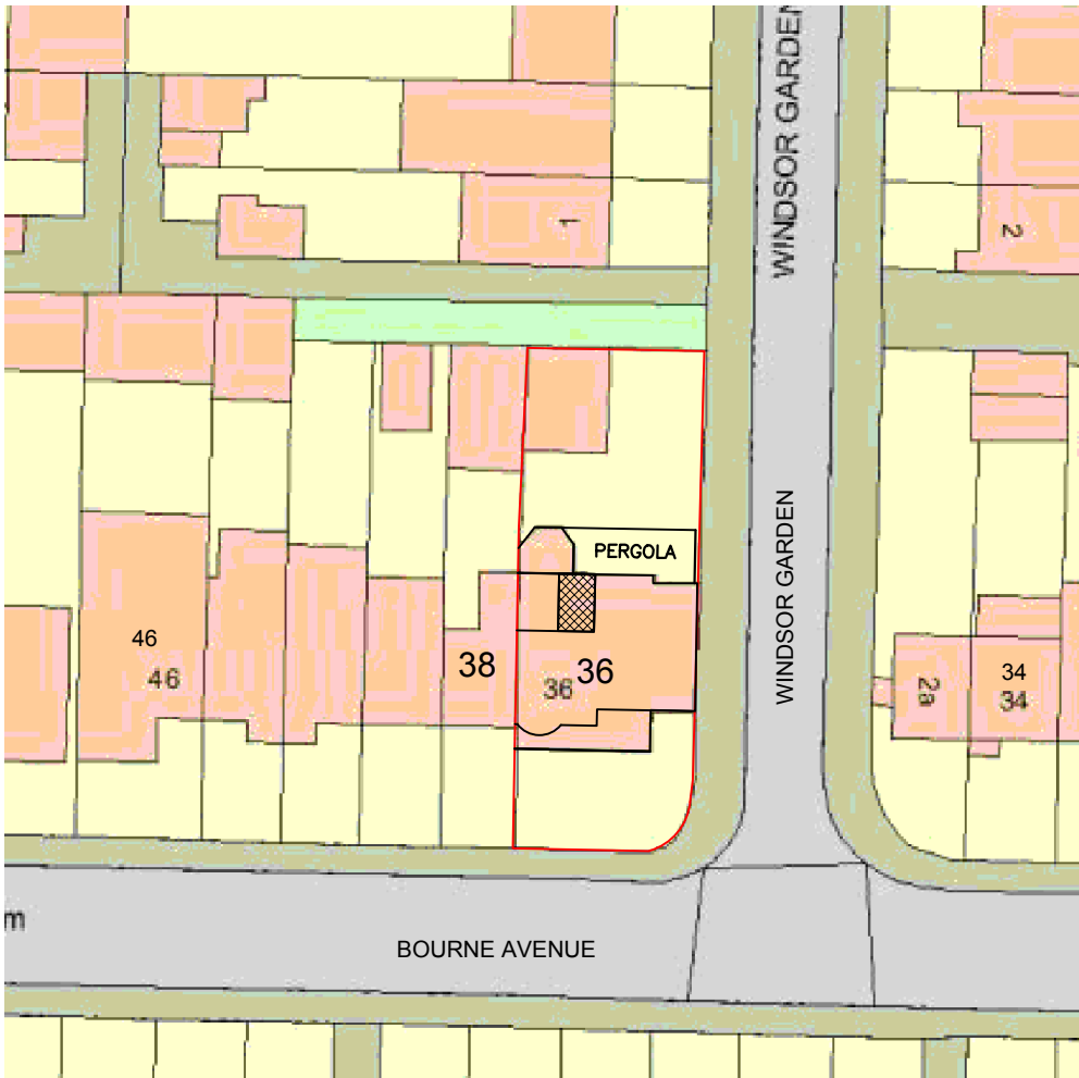
BLOCK PLAN SCALE= 1:500