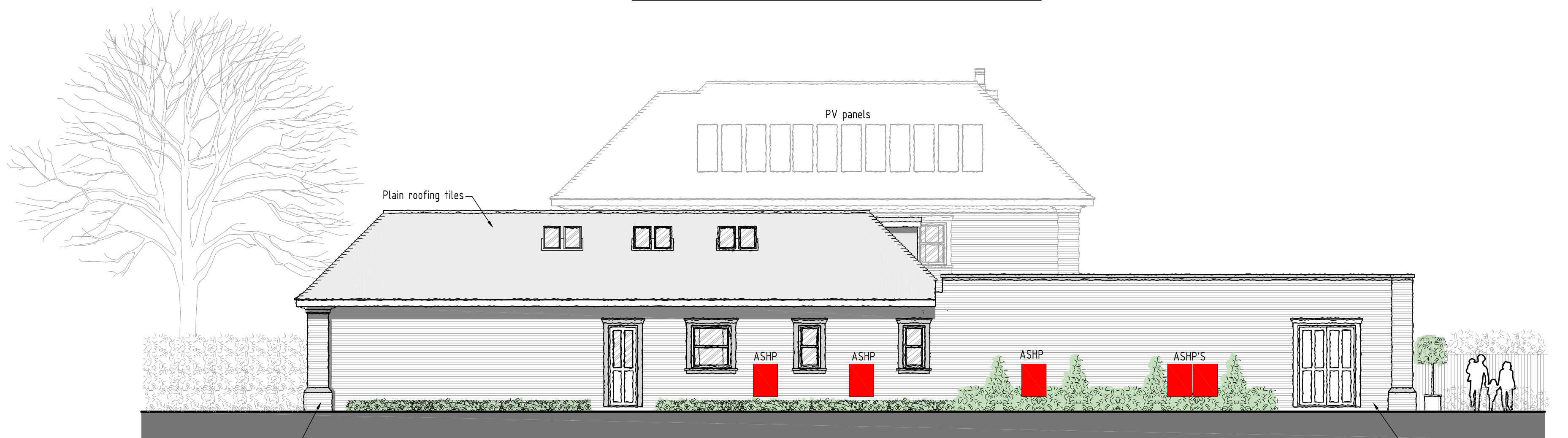
P R O P O S E D S I D E E L E V A T I O N