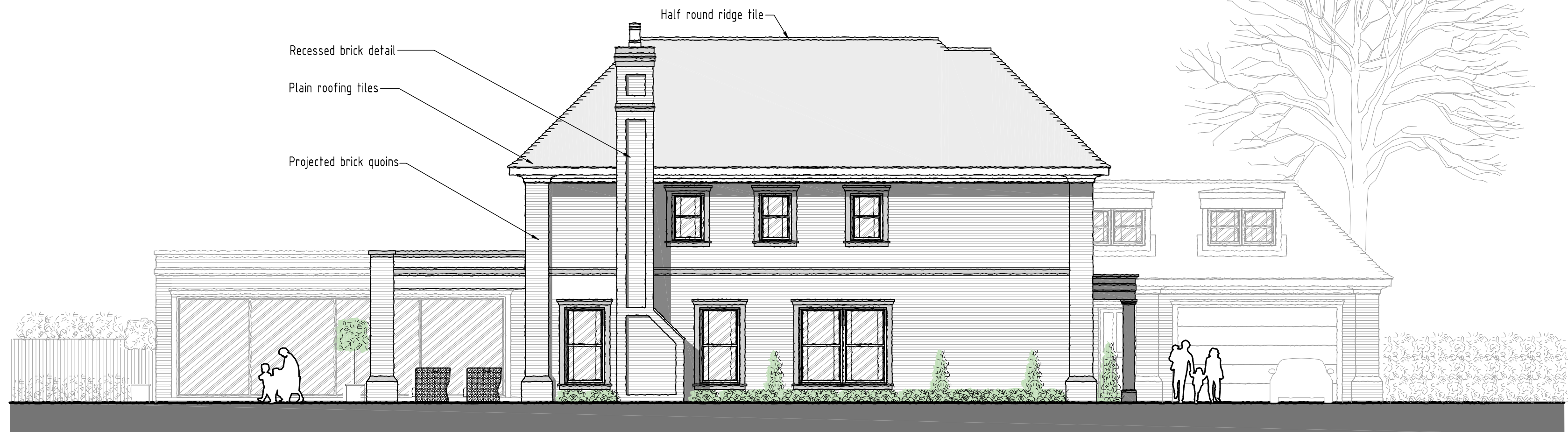
P R O P O S E D S I D E E L E V A T I O N