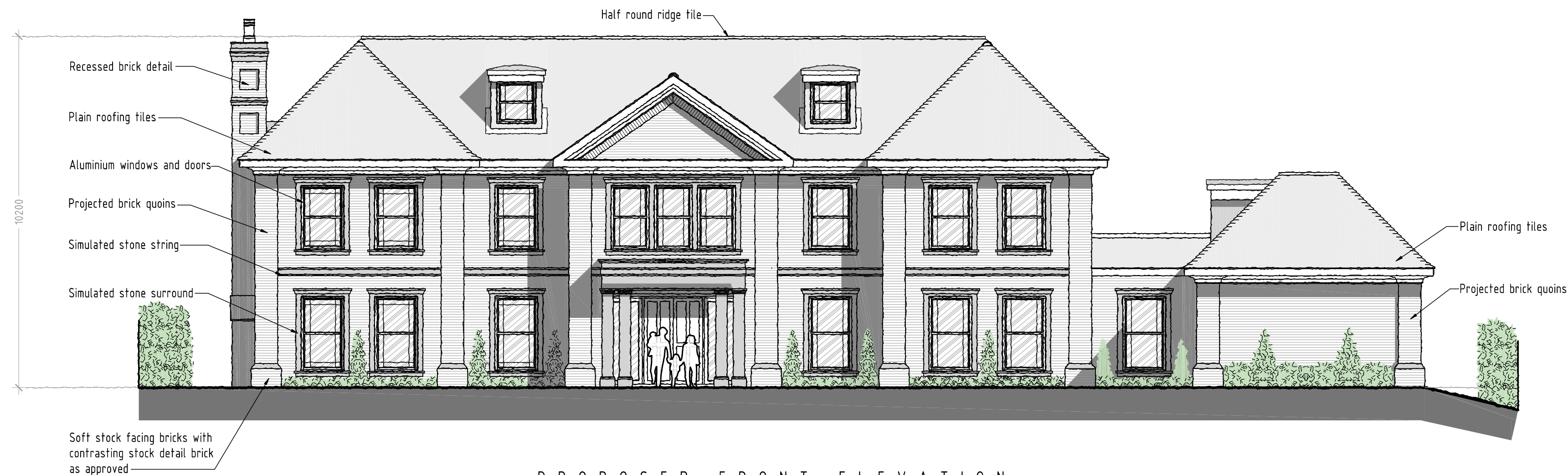
P R O P O S E D F R O N T E L E V A T I O N