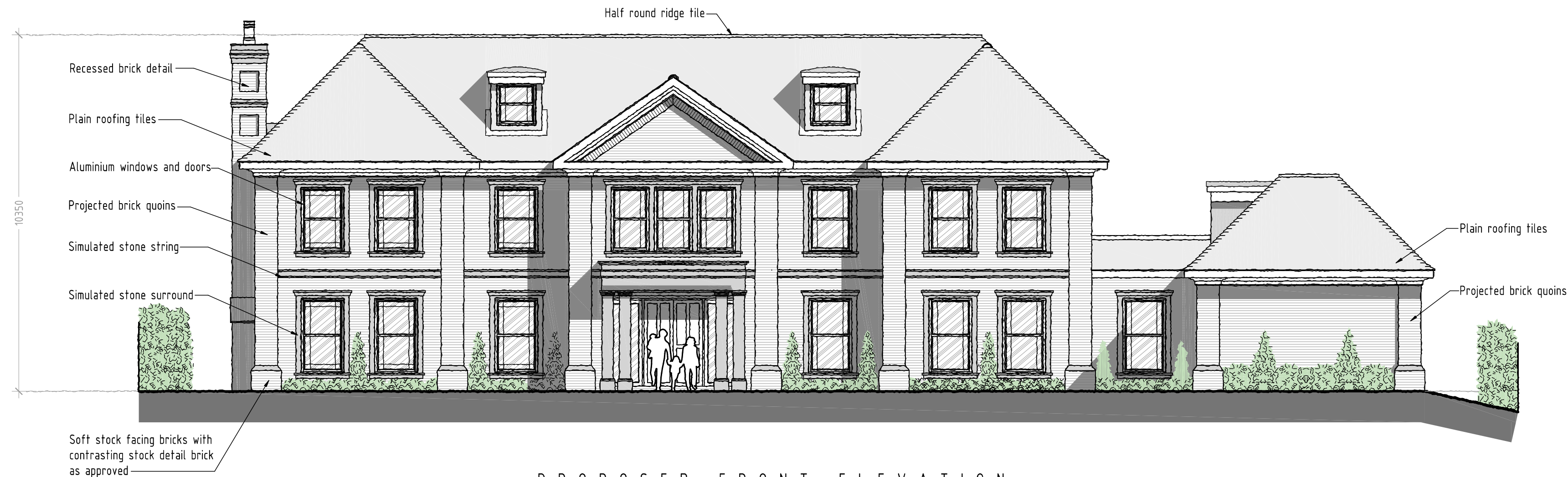
P R O P O S E D F R O N T E L E V A T I O N