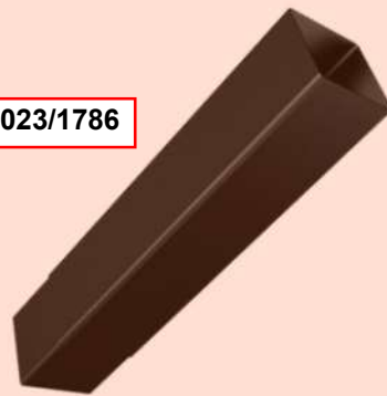
Aluminium square hopper, with square downpipe Colour, RAL7016

Material approved under application 51175/APP/2023/1786