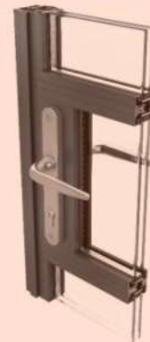
Type:Patio/Balcony Door-Smart Architectural Aluminium, Alitherm Heritage Range

Material approved under application 51175/APP/2023/1786