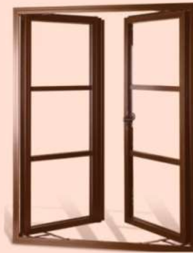
Type:Windows-Smart Architectural Aluminium, Alitherm Heritage Range Grey aluminium window Colour Anthracite Grey RAL7016