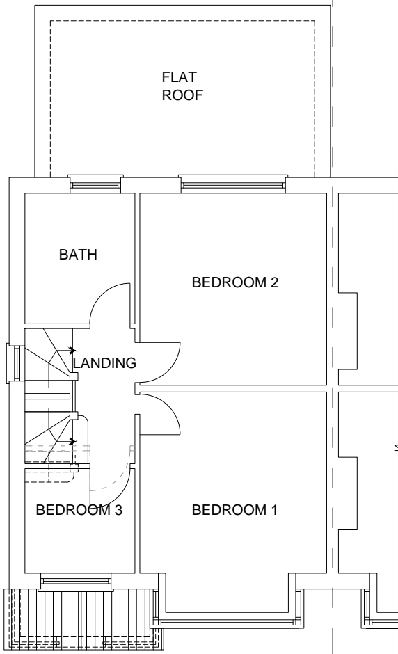
PRE-EXISTING FIRST FLOOR PLAN SCALE 1:100