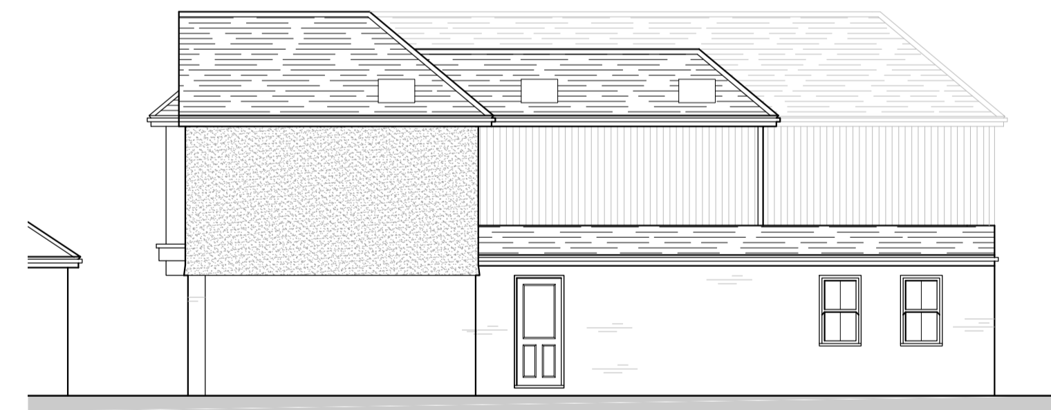
PROPOSED FLANK ELEVATION