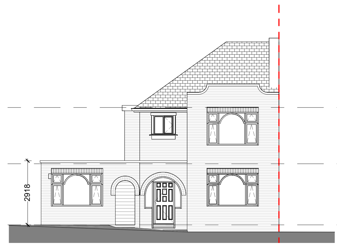
Proposed Front Elevation 1 : 100