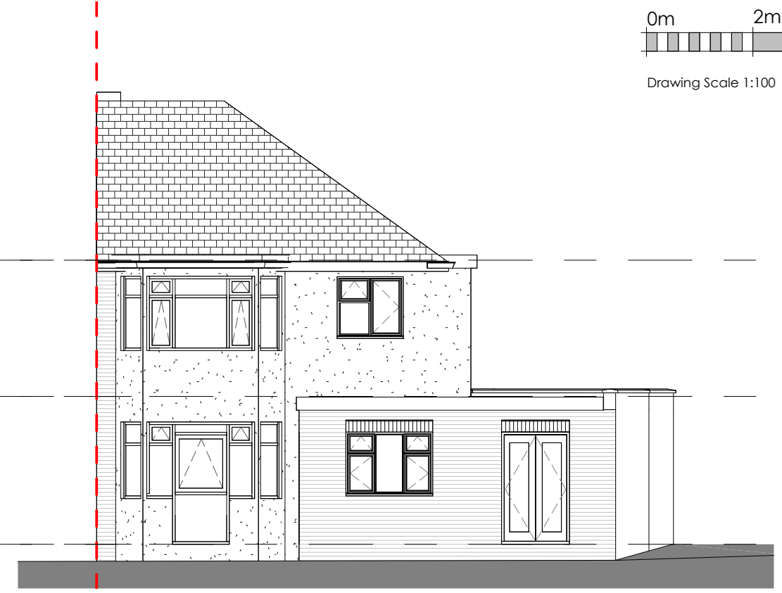
Proposed Rear Elevation 1 : 100