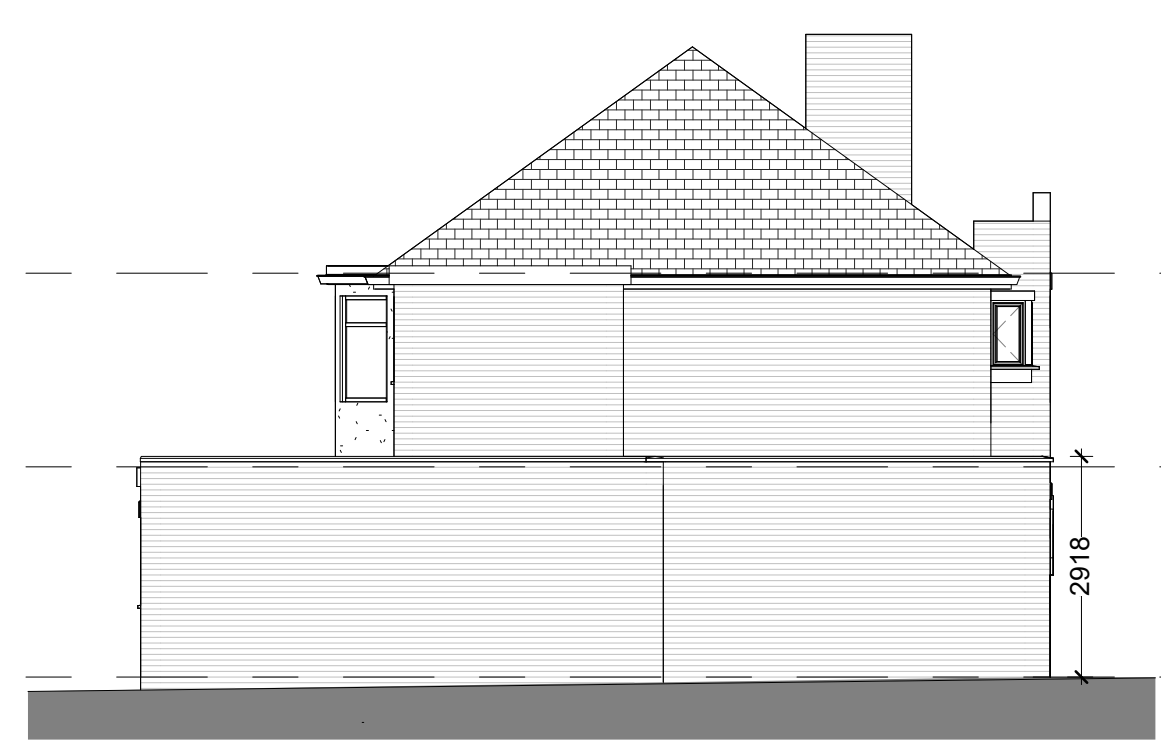
Proposed Side Elevation 1 : 100