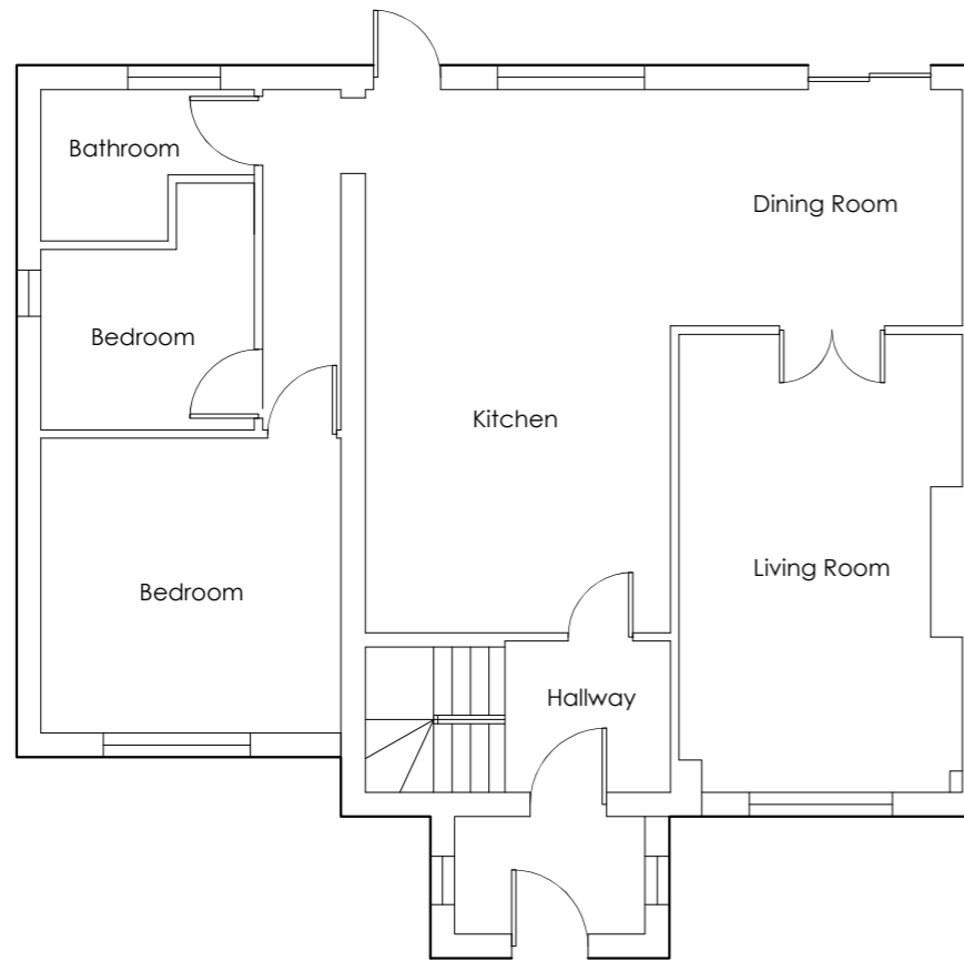
EXISTING GROUND FLOOR