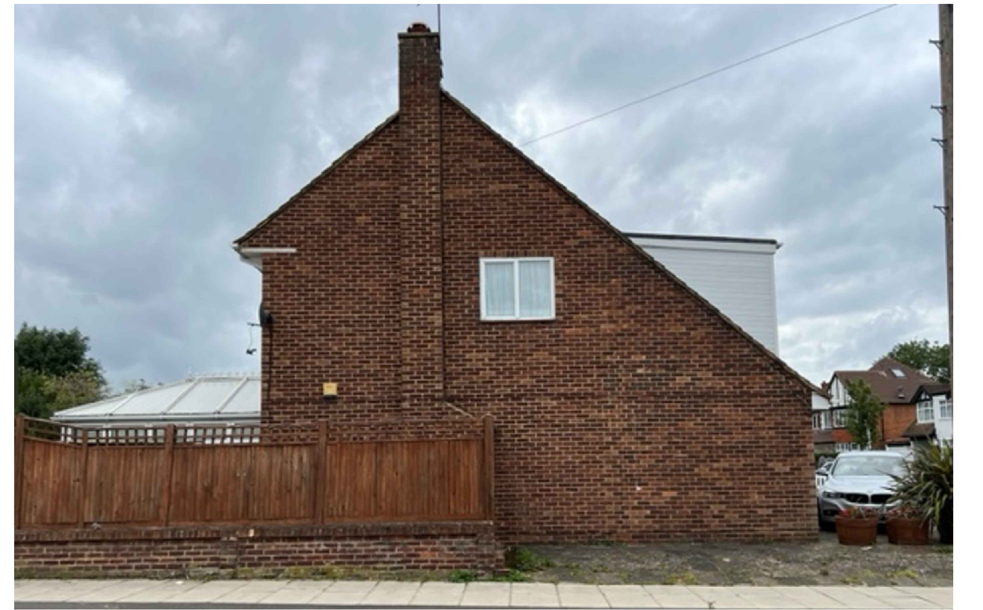
3 EXISTING SIDE - Along Ridgeway