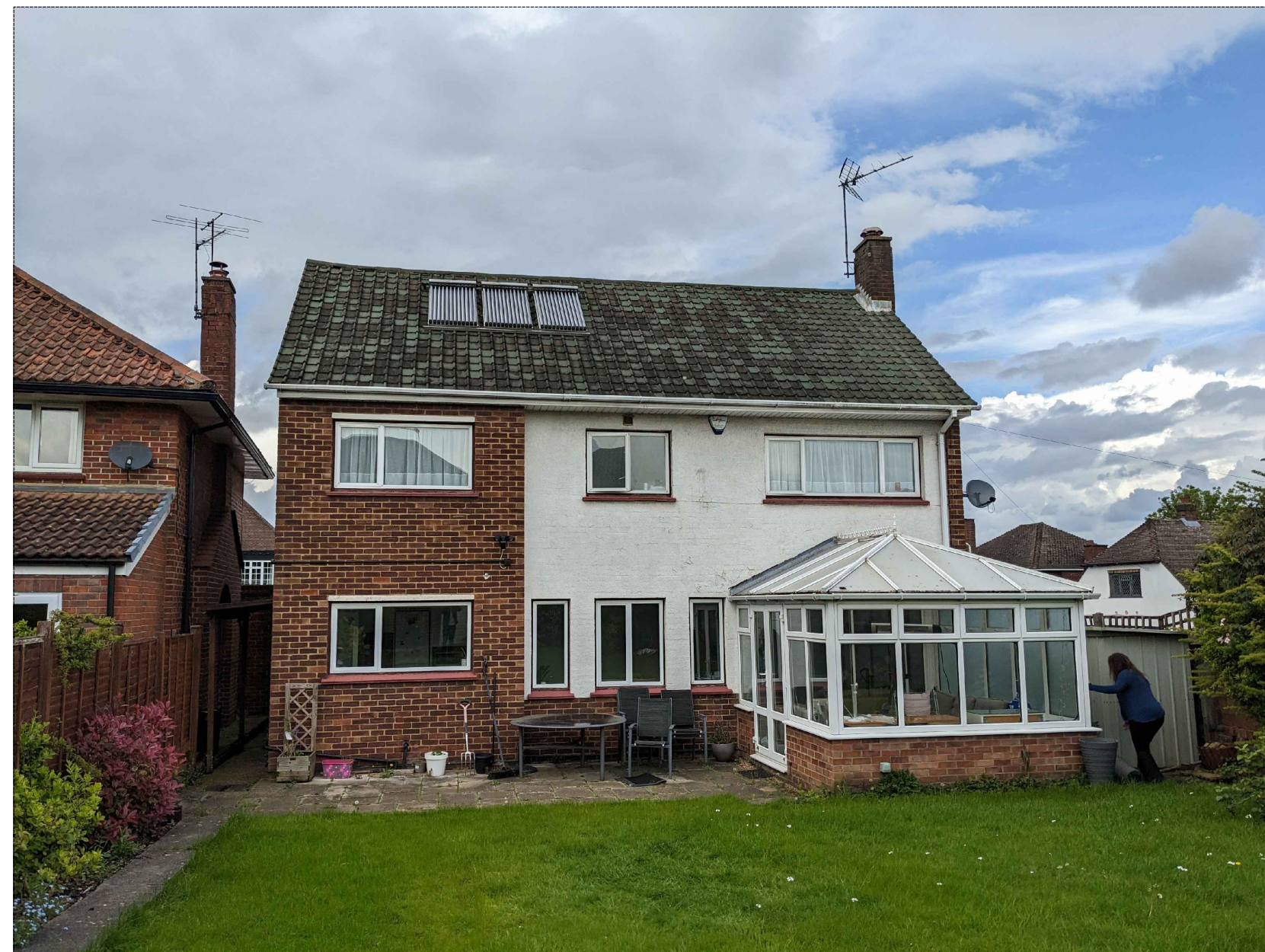
2 EXISTING REAR