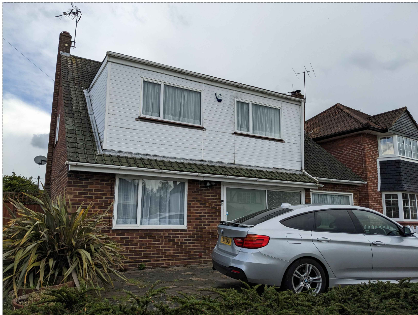
1 EXISTING FRONTAGE