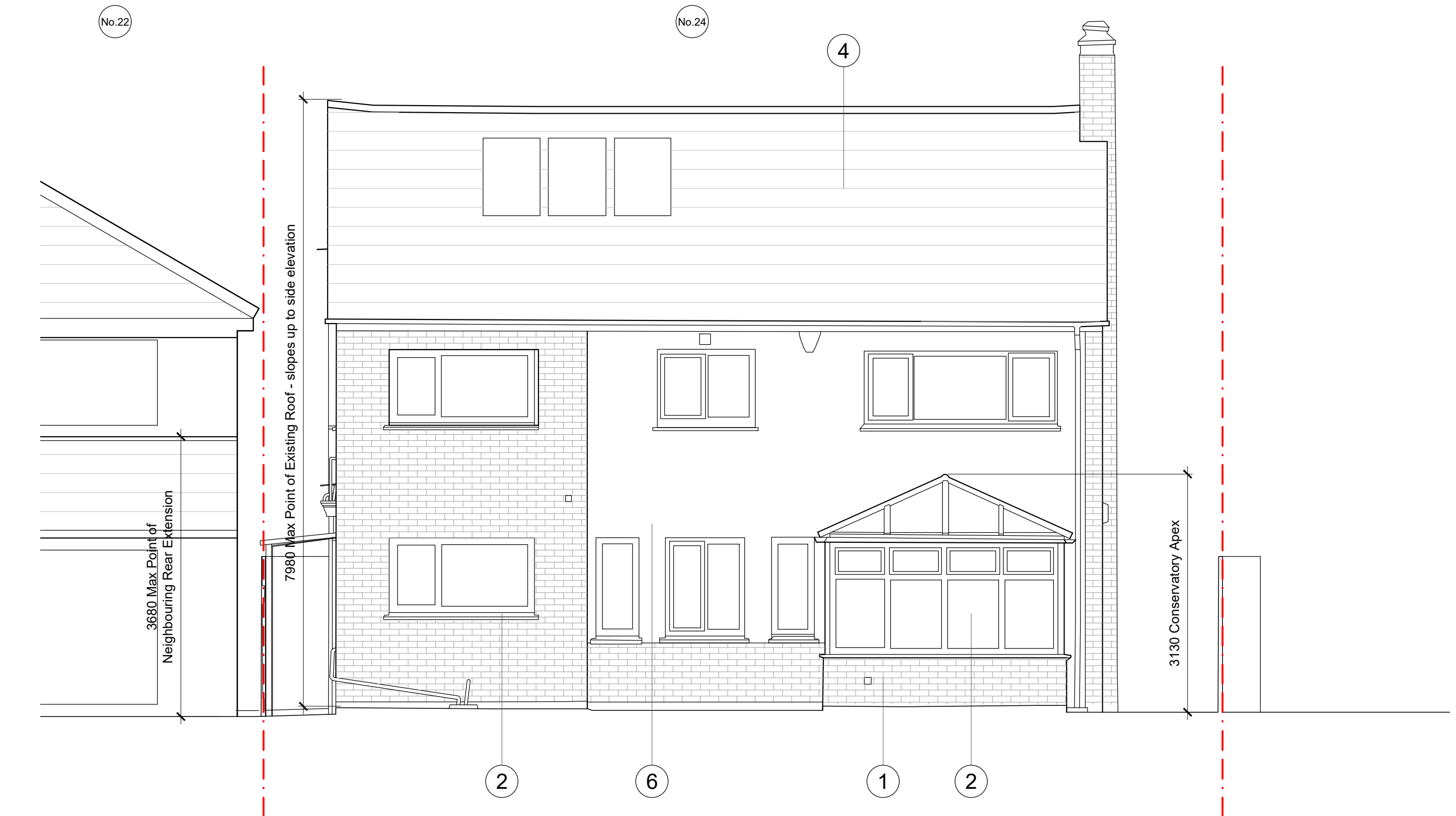
2 EXISTING REAR ELEVATION 1:50 @ A1, 1:100 @ A3