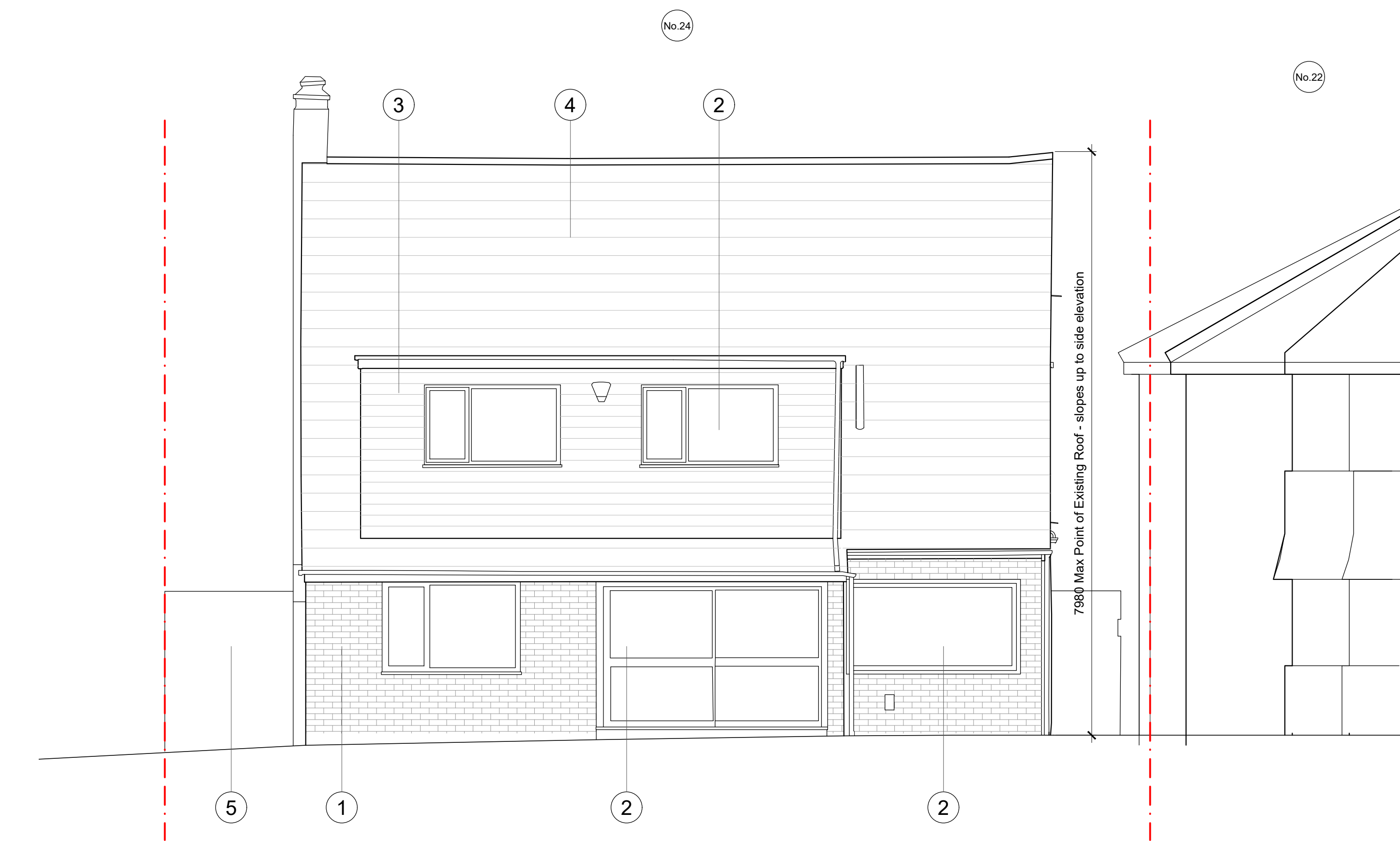
1 EXISTING FRONT ELEVATION 1:50 @ A1, 1:100 @ A3