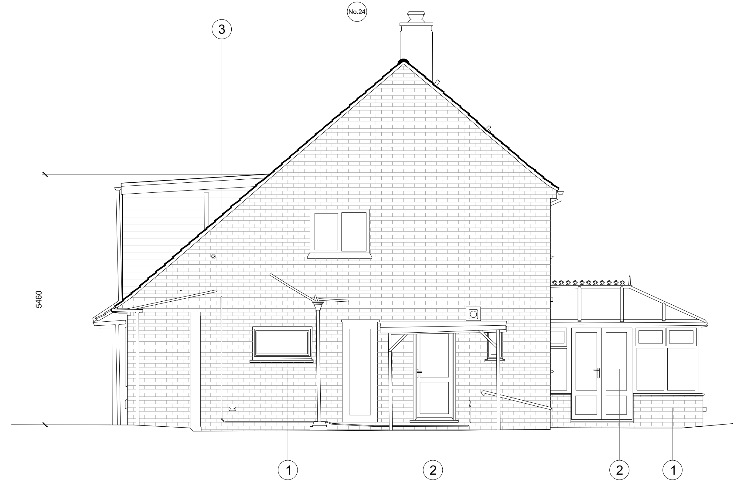
3 EXISTING SIDE / WEST ELEVATION 1:50 @ A1, 1:100 @ A3