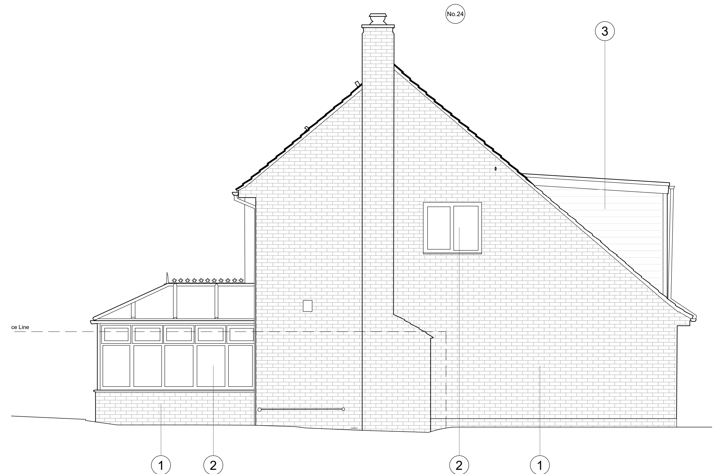
4 EXISTING SIDE / EAST ELEVATION ALONG THE RIDGEWAY 1:50 @ A1, 1:100 @ A3