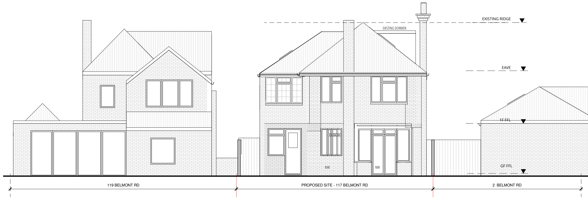
01 PROPOSED REAR ELEVATION 1:150 @ A3