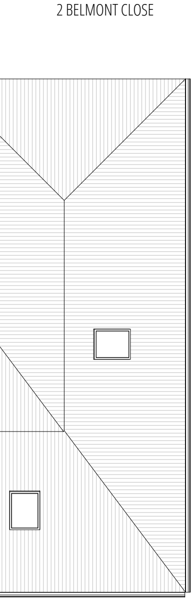
2A BELMONT CLOSE