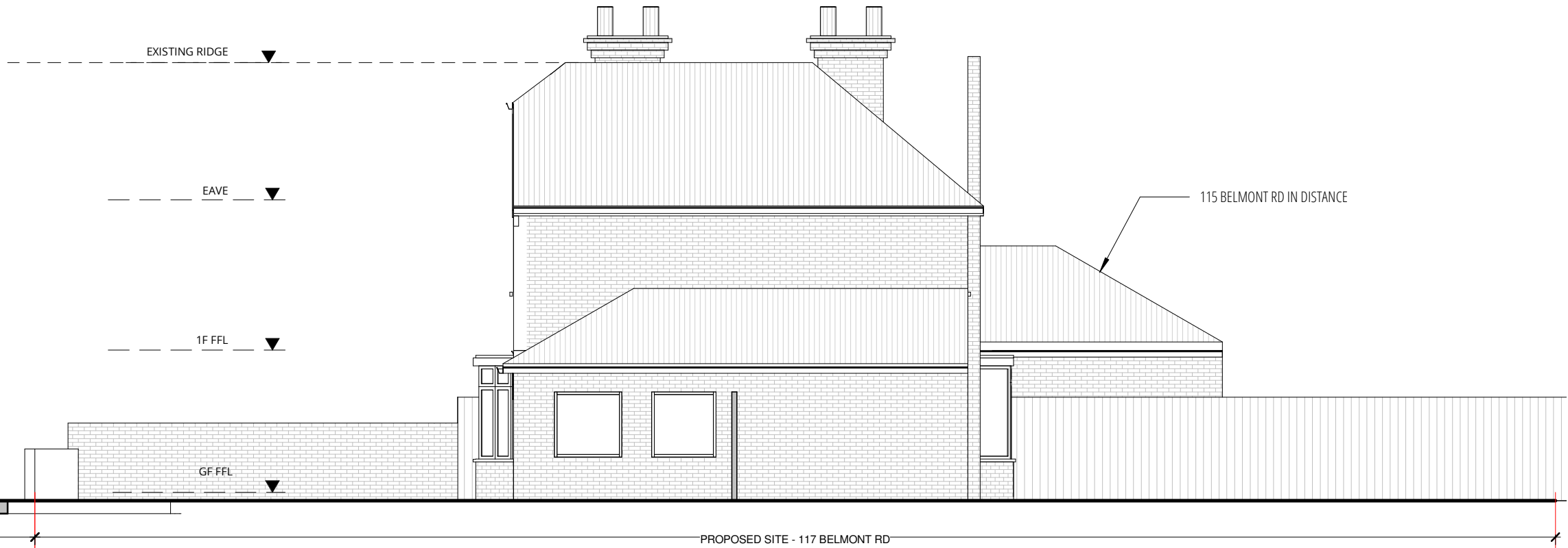
02 EXISTING SIDE / EAST ELEVATION 1:150 @ A3