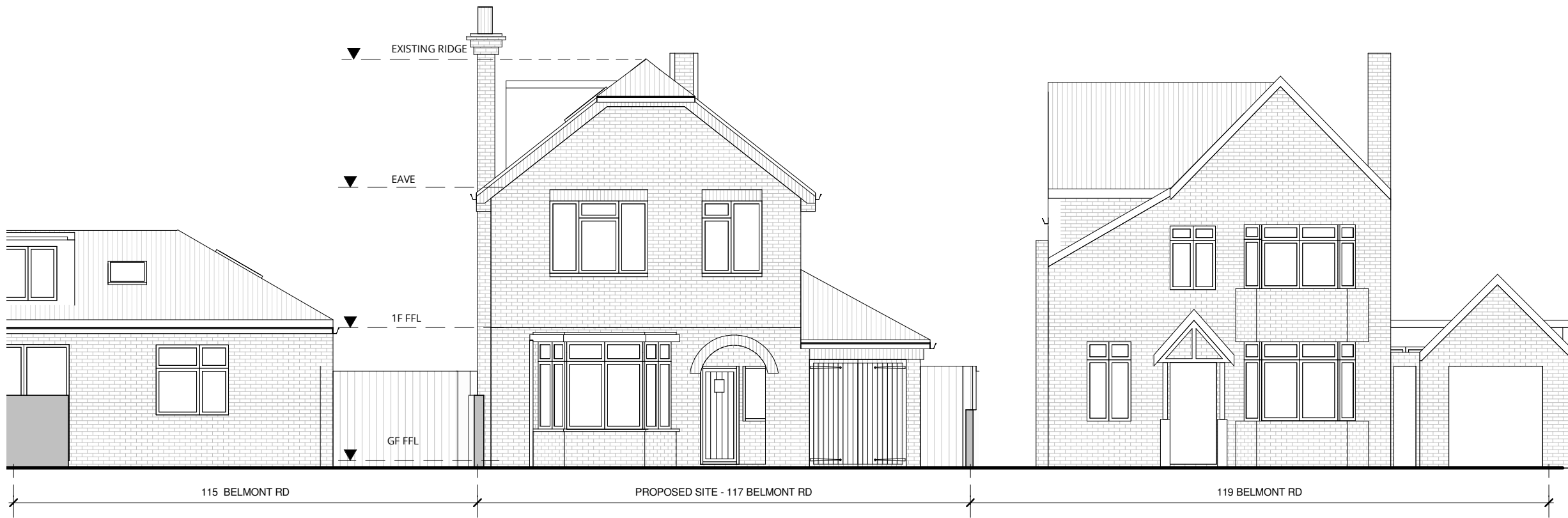
01 EXISTING FRONT ELEVATION 1:100 @ A3