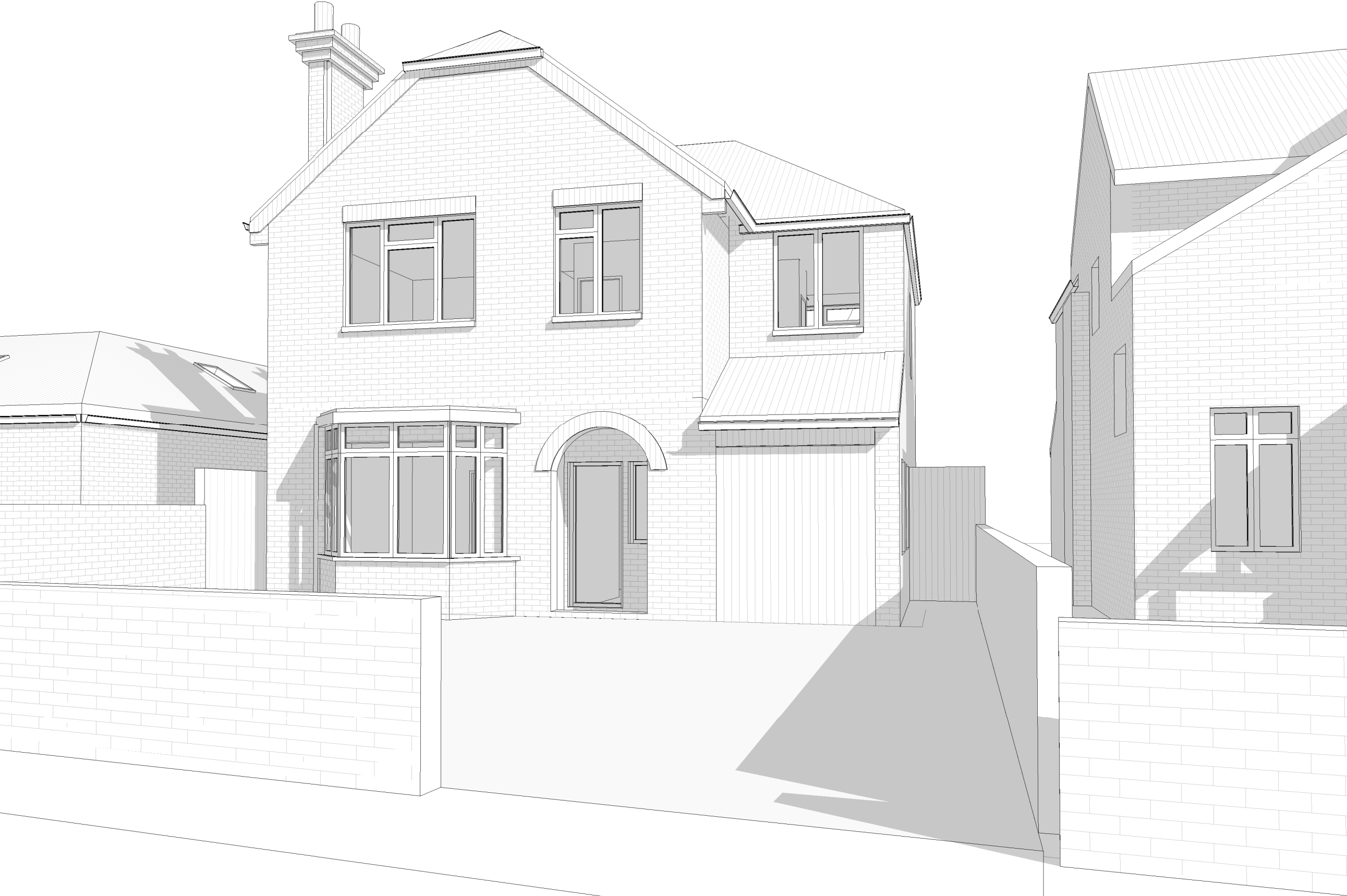
01 PROPOSED FRONT VIEW NTS @ A3