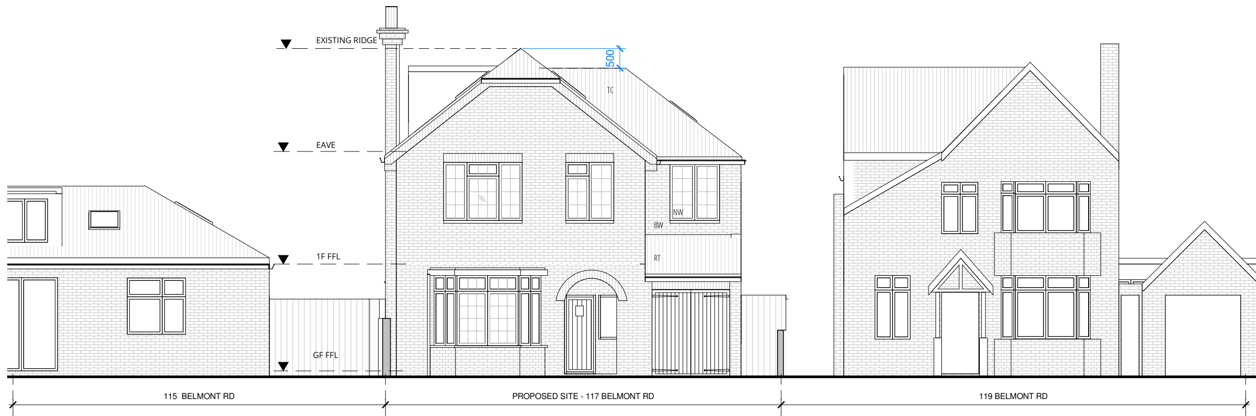
01 PROPOSED FRONT ELEVATION 1:100 @ A3