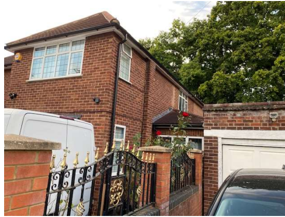
Photograph B – Looking towards No. 129