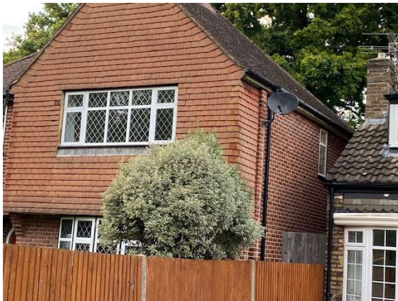
Photograph C / D - Gap between 131 and 133