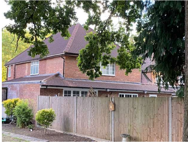
Photograph F – Looking towards no. 129