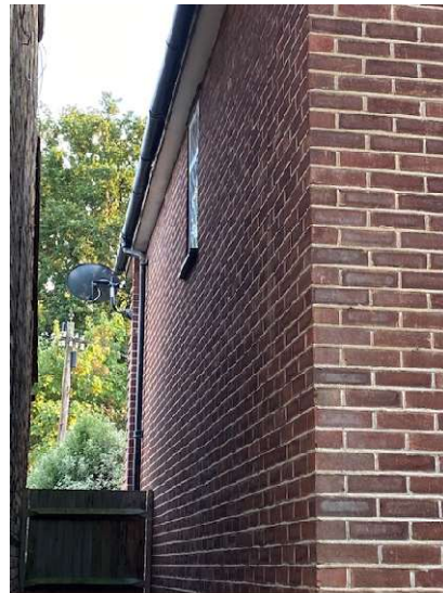
Photograph H / I – Looking at gap between 131 and 133