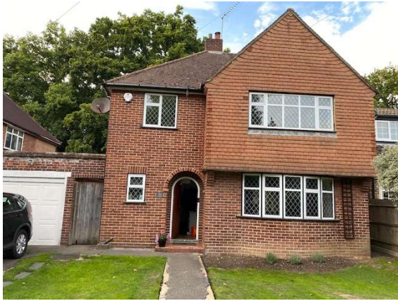
Photograph A – Front Elevation