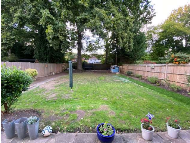
Photograph J – Looking towards T1 oak