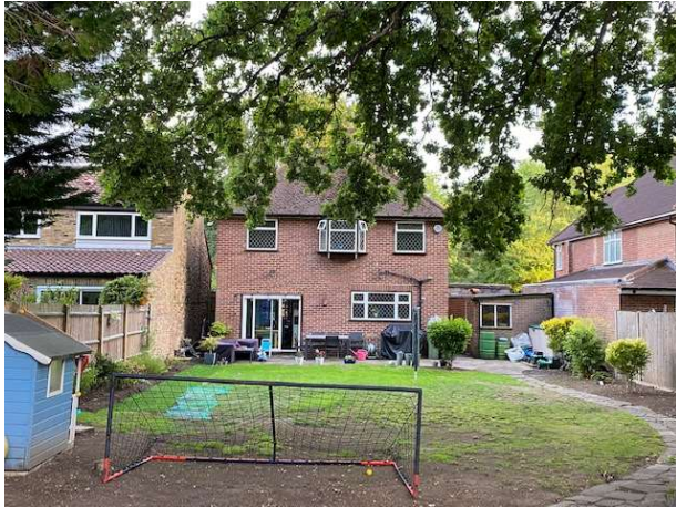
Photograph E – Rear Elevation