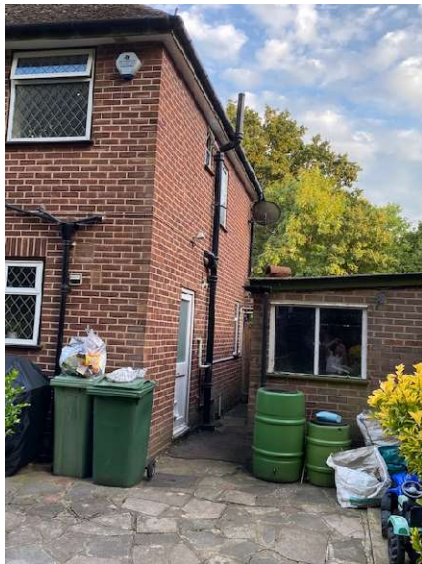
Photograph L – Looking towards the existing garage and side elevation