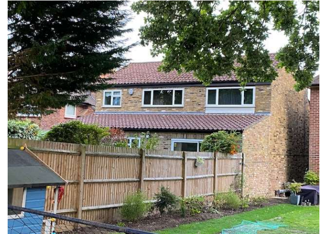
Photograph G – Looking towards no. 133