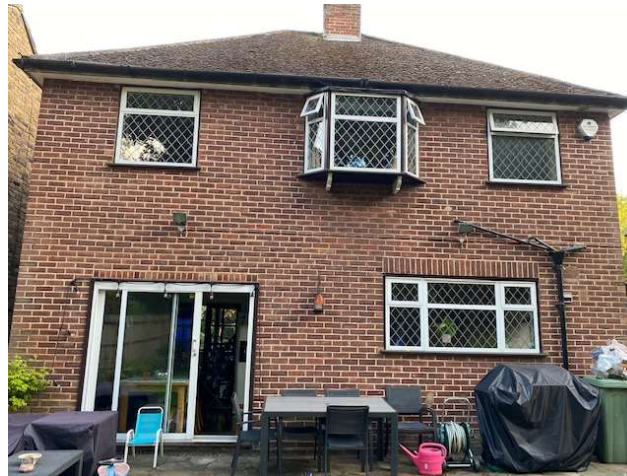
Photograph K – Rear elevation