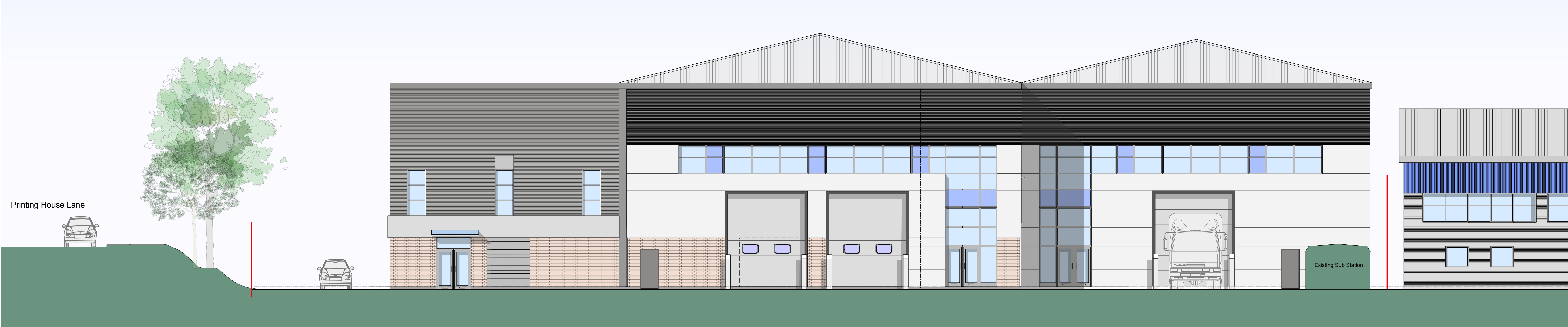
2 Proposed South Elevation Scale: 1:100