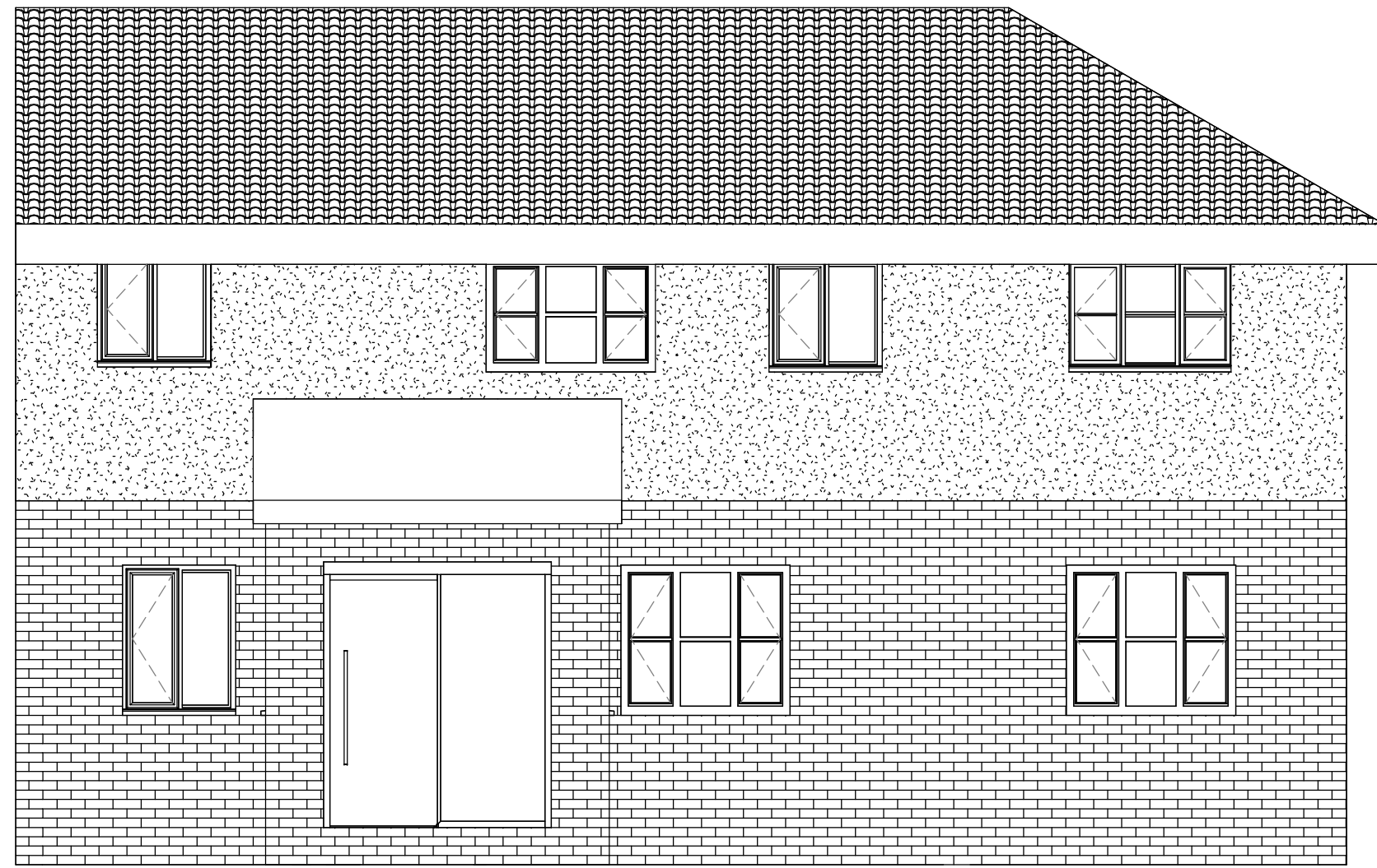
3 EXISTING FRONT ELEVATION 1 : 50