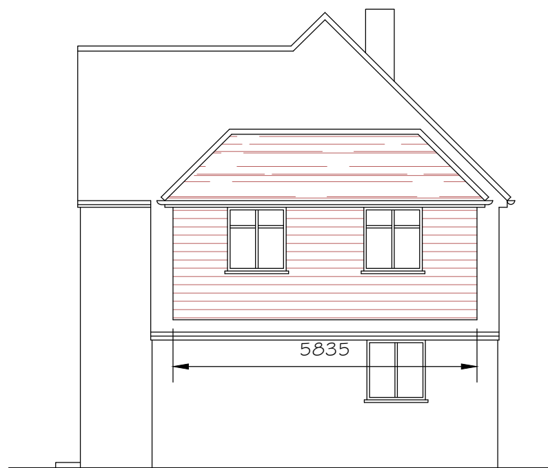
SIDE ELEVATION FACING No. 58