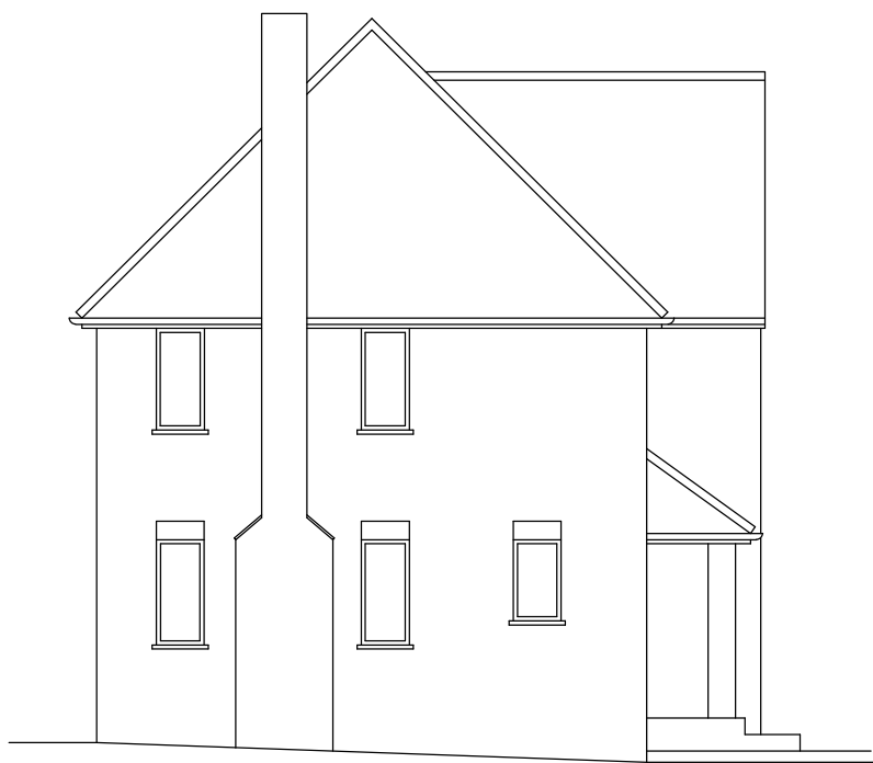
SIDE ELEVATION FACING No. 62

NEW TILES TO PITCHED ROOF & TILE HANGING TO MATCH EXISTING.