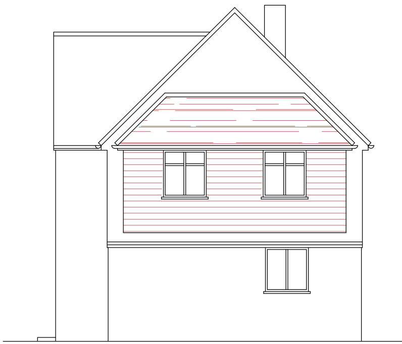
SIDE ELEVATION FACING No. 58