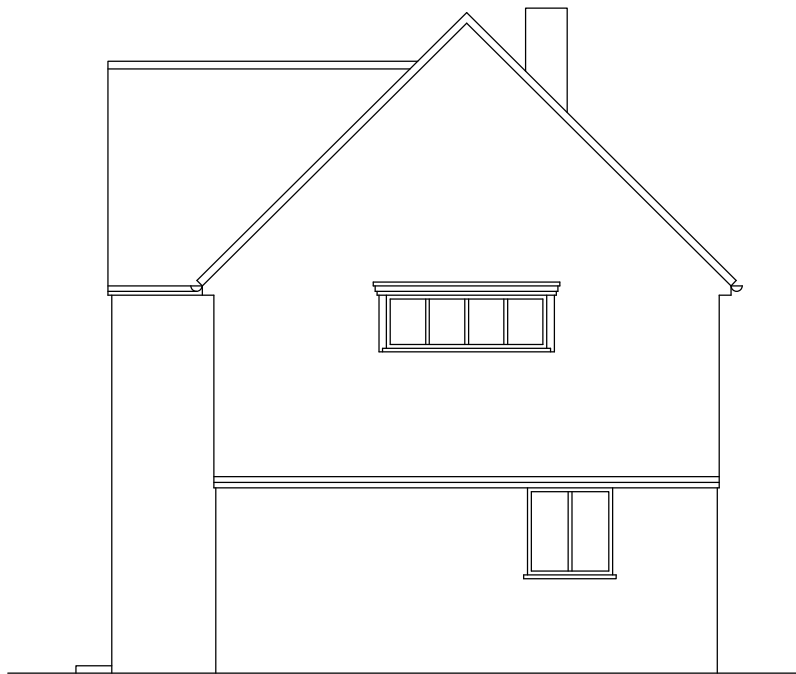
SIDE ELEVATION FACING No. 58