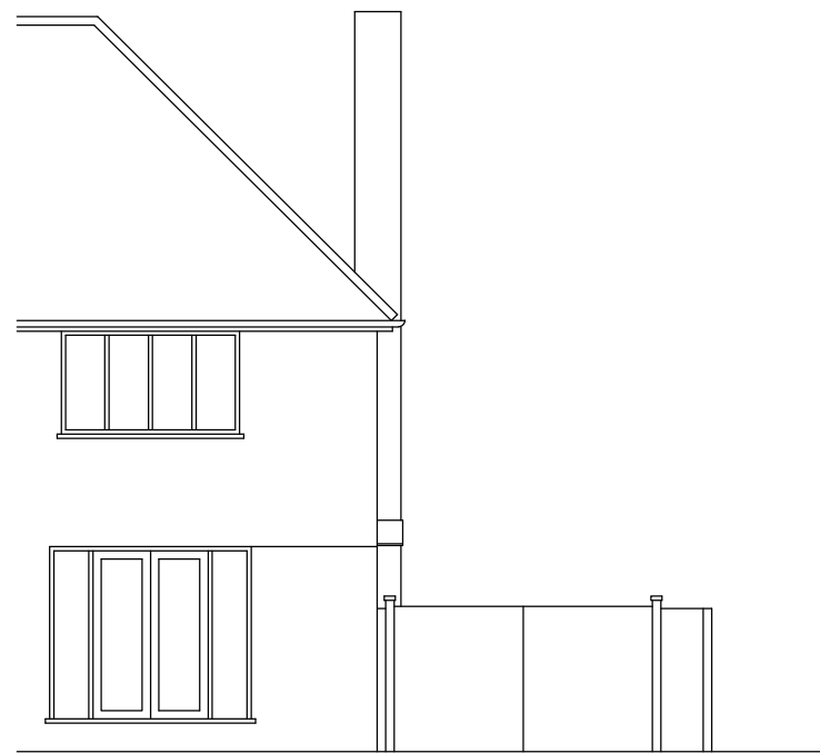
PART REAR ELEVATION