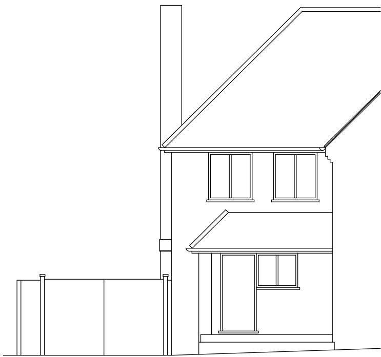
PART FRONT ELEVATION