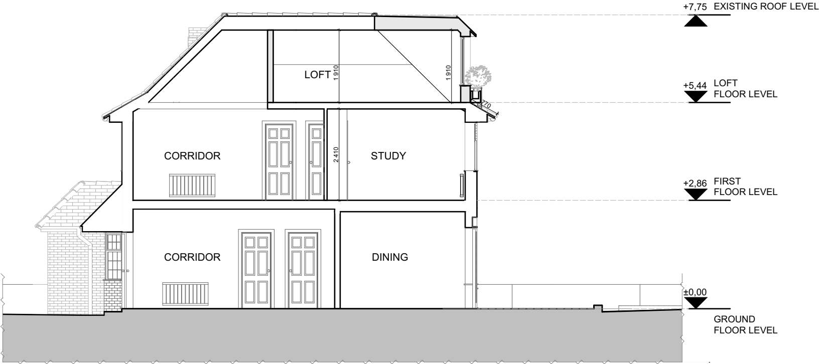
GA (0) 10 Cross Section A-A as Proposed 1:100