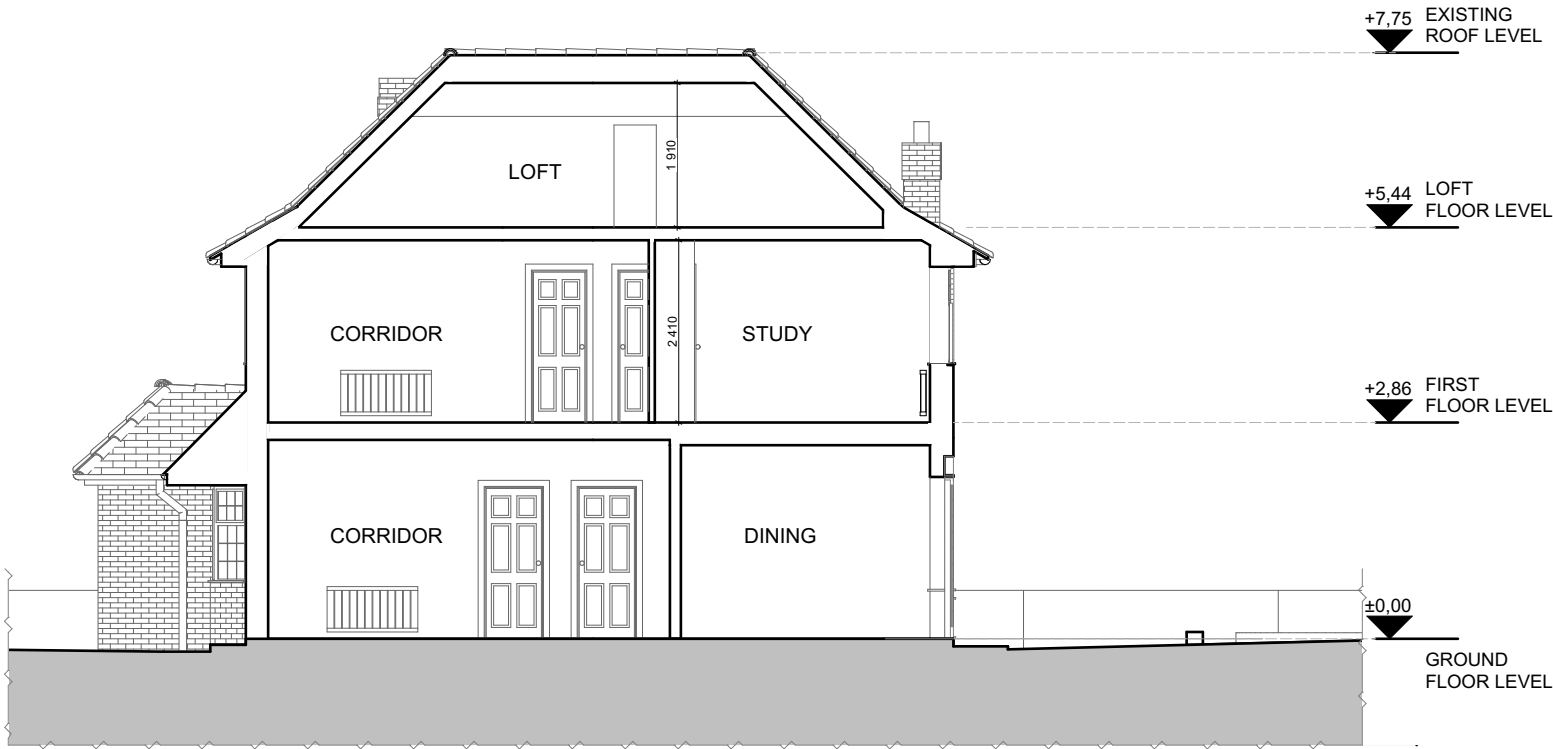
E (0) 10 Cross Section A-A as Existing 1:100