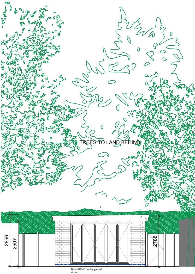
ELEVATION A Scale 1:100

Do not scale off this drawing. All dimensions to be checked on site prior to manufacture and construction. This drawing is the property of 512 Design Studio and should not be reproduced without permission. All discrepancies to be brought to the attention of the architect immediately. This drawing is to be read in conjunction with the specification / bill of quantities and related drawings.