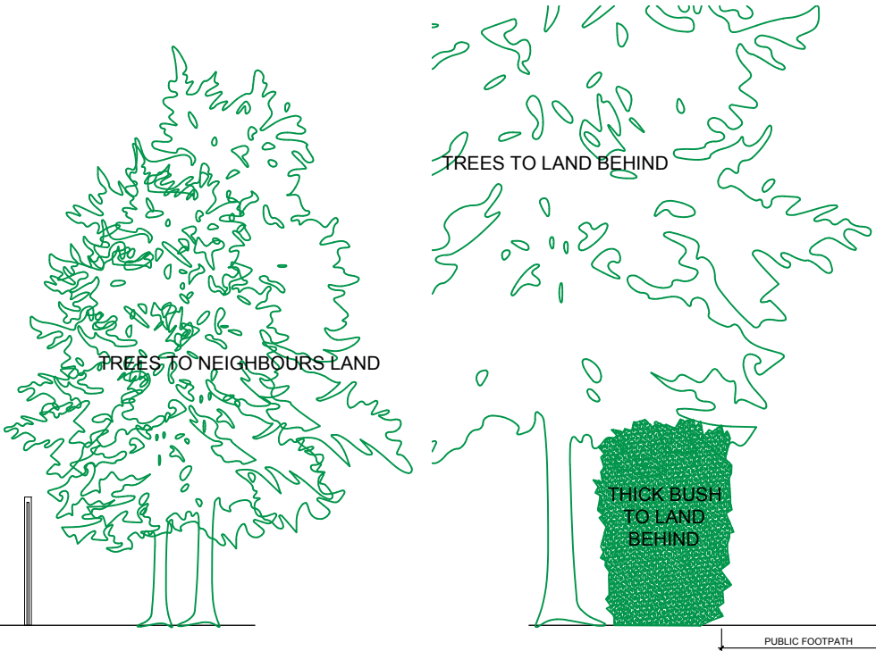
ELEVATION D Scale 1:100