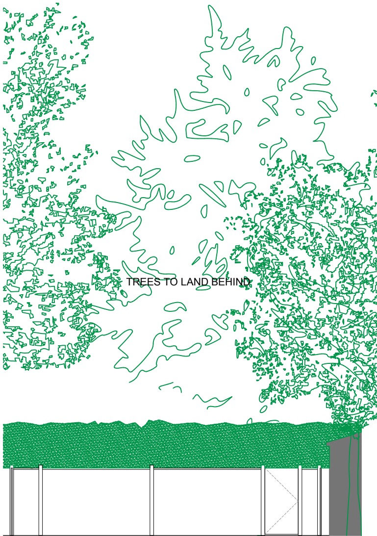
ELEVATION A Scale 1:100