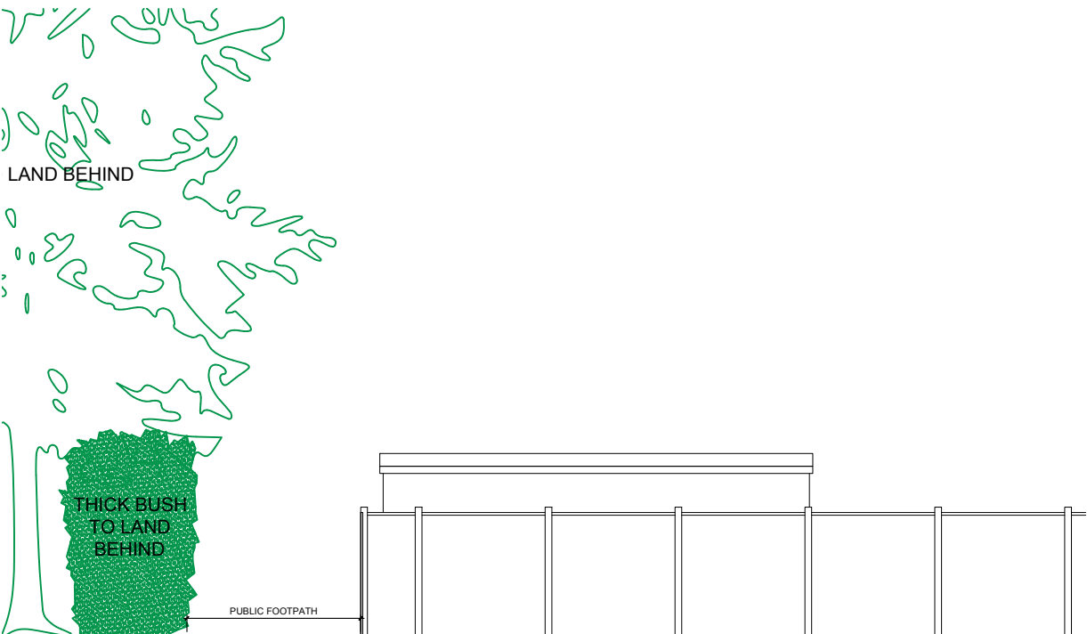
ELEVATION C Scale 1:100