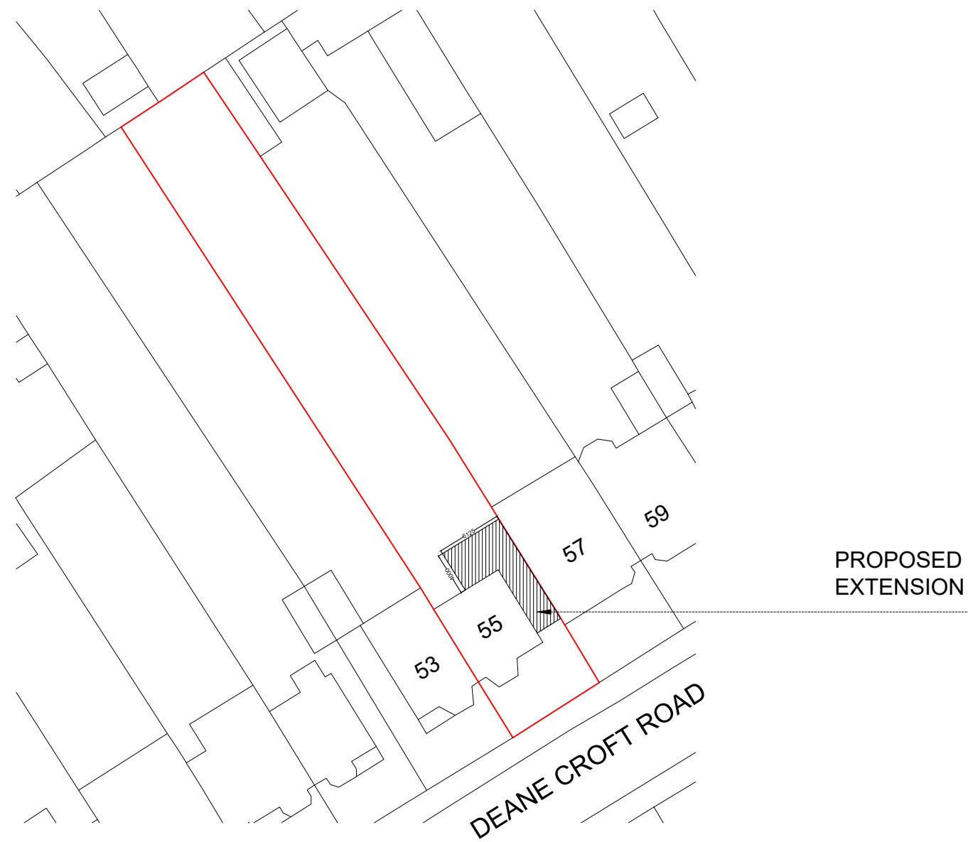
PROPOSED FIRST FLOOR BLOCK PLAN SCALE 1:500