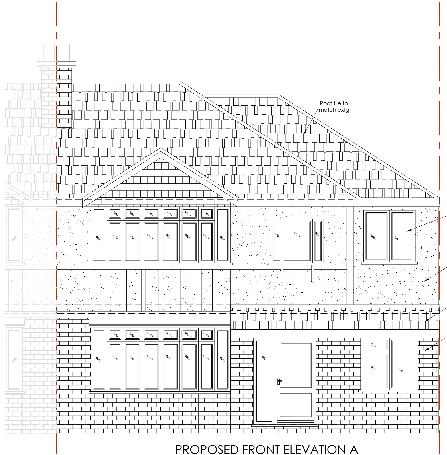
PROPOSED FRONT ELEVATION A SCALE 1:50