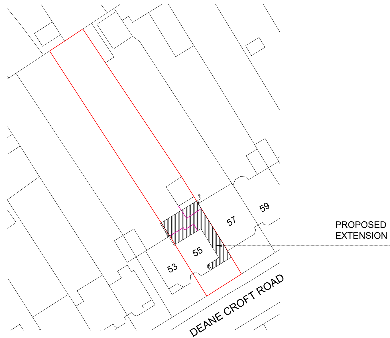
PROPOSED GROUND FLOOR BLOCK PLAN SCALE 1:500