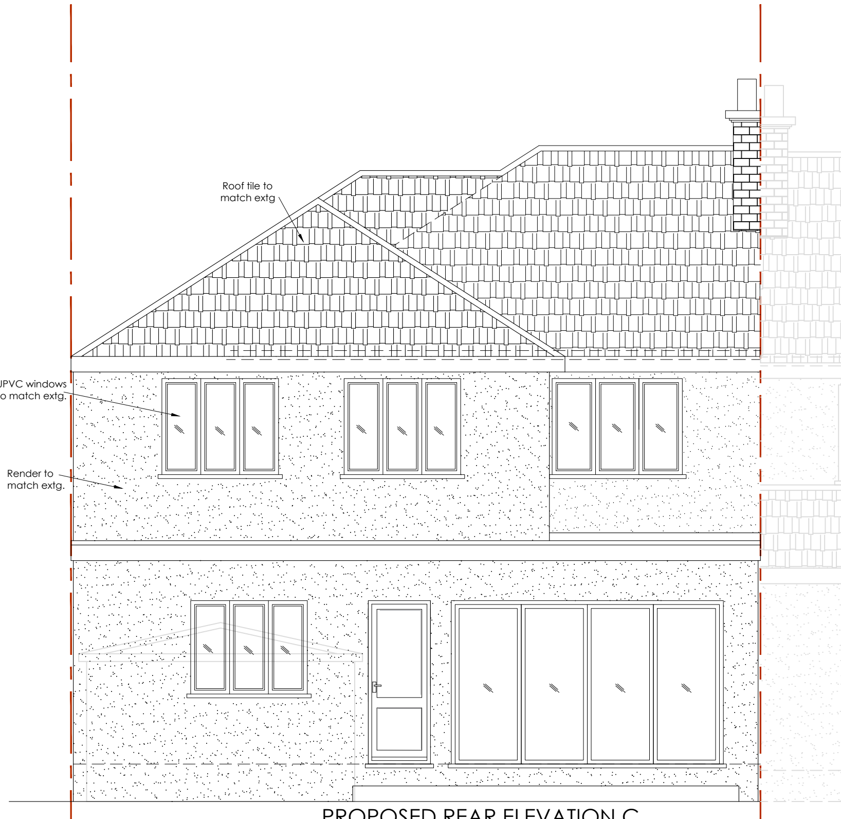
PROPOSED REAR ELEVATION C SCALE 1:50