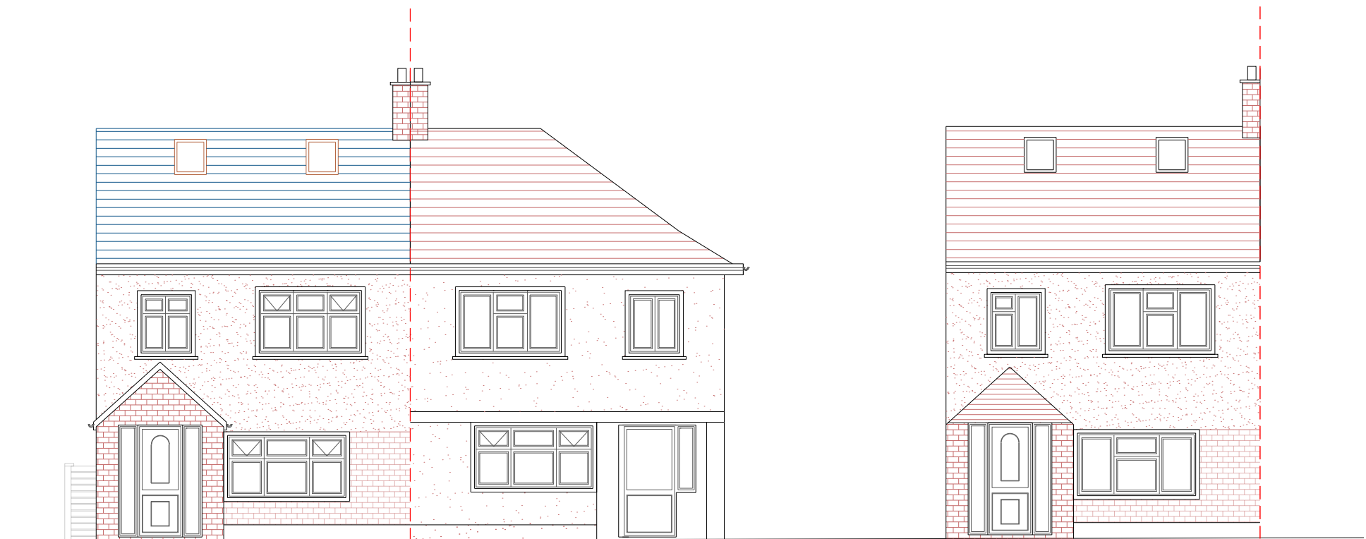
PROPOSED STREET ELEVATION SCALE: 1:100