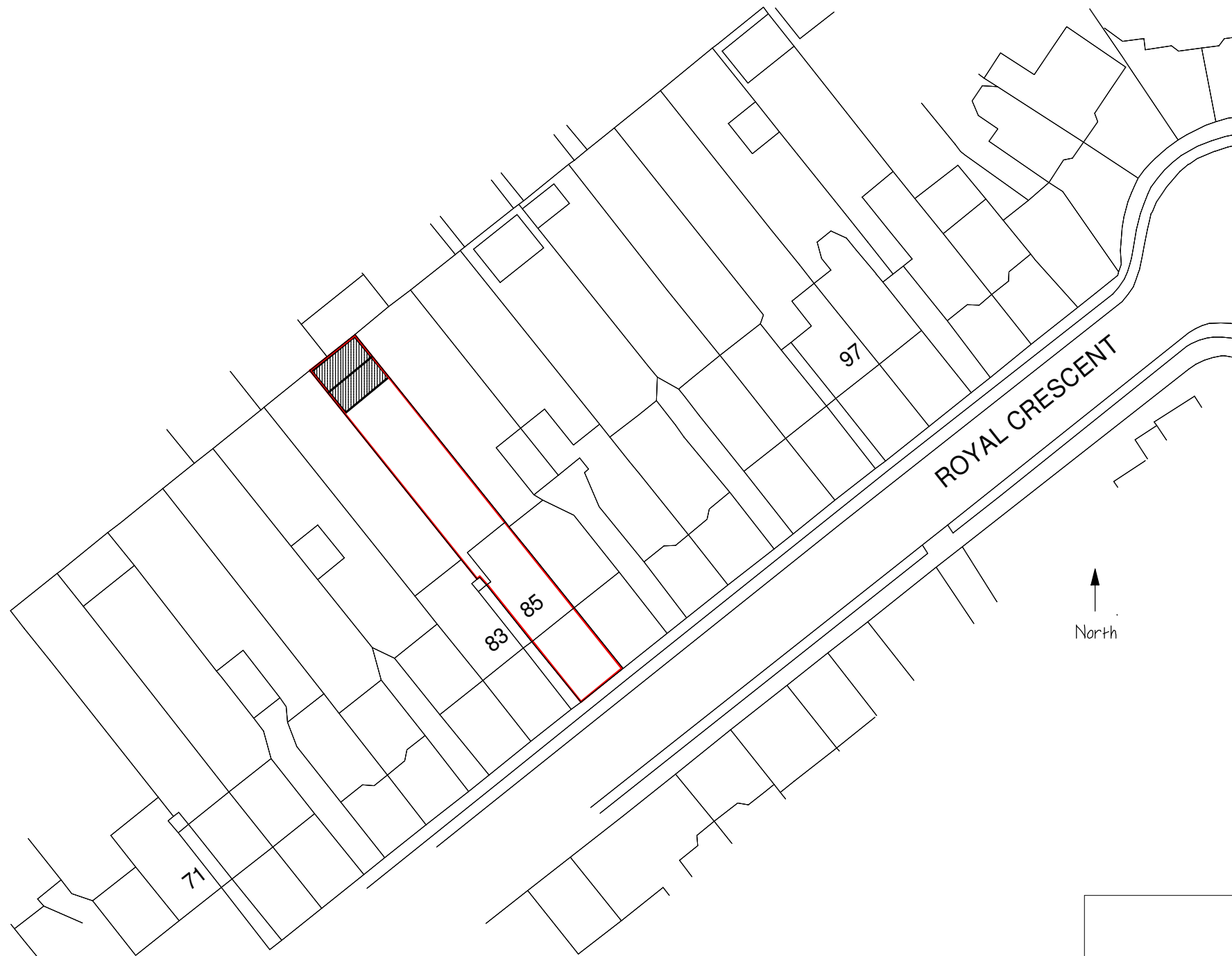
Block Plan: 1:500