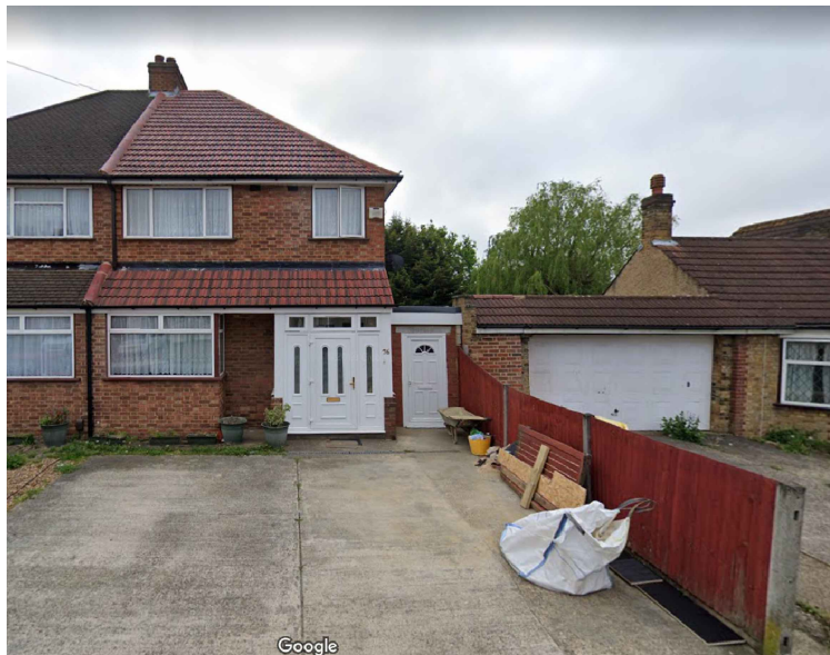
Existing Front Elevation of 76 Star Road