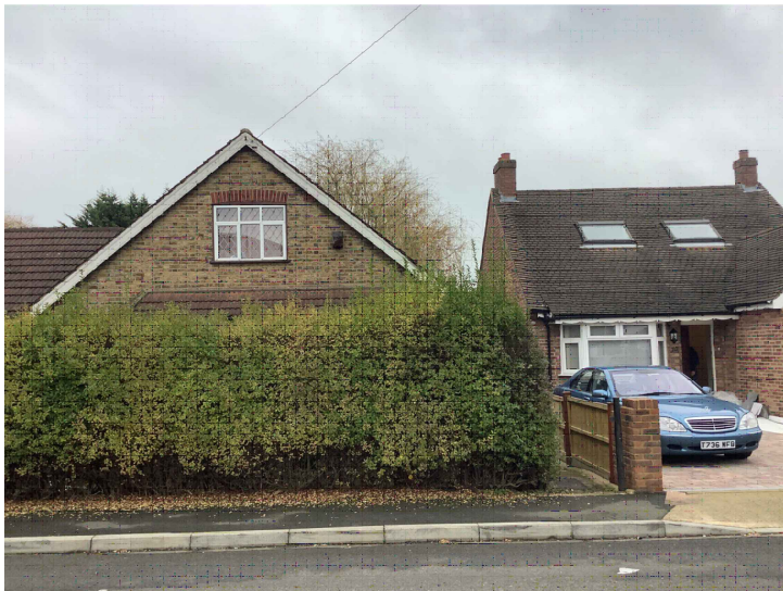
Existing Front Elevation of 72 and 70 Star Road