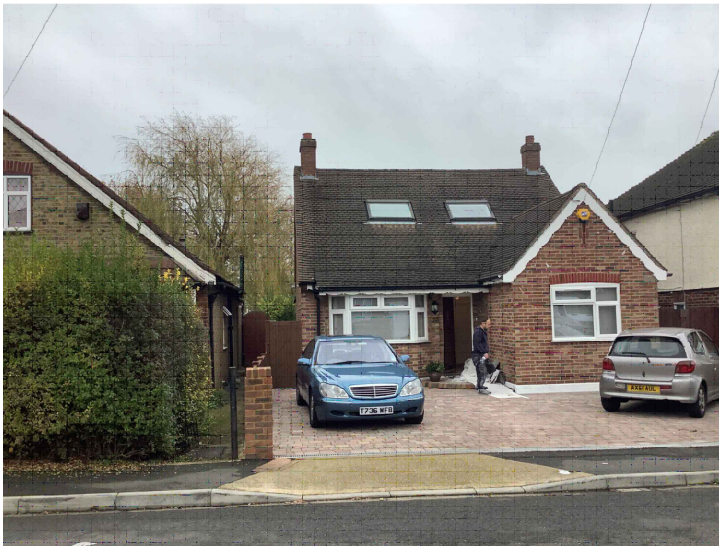
Existing Front Elevation of 70 Star Road

Construction of Block of Flats involving demolition of existing Bungalow