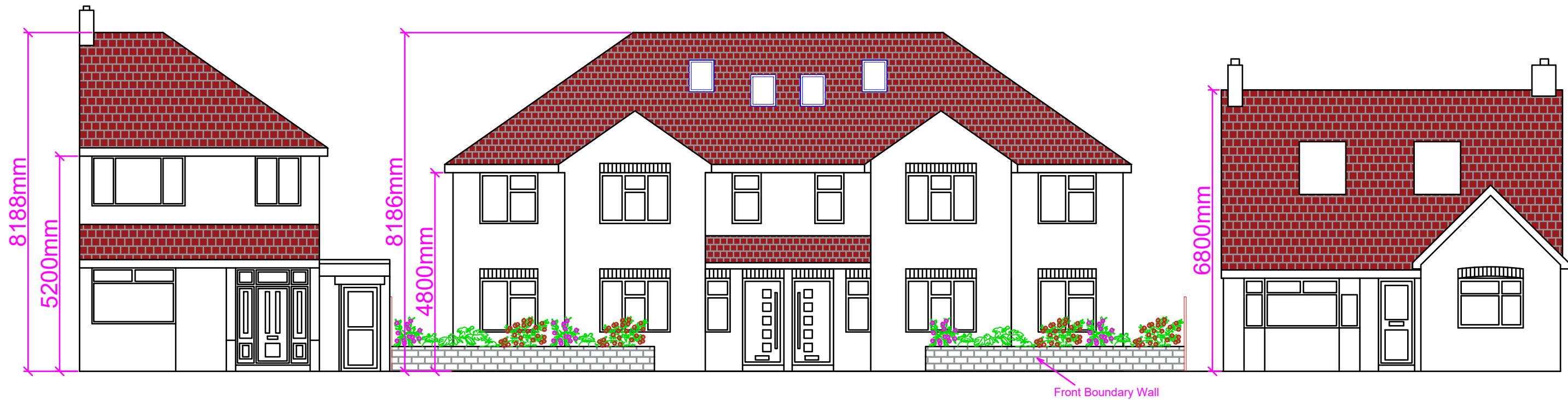
Existing Front Elevation of 76 Star Road

Note: The Drawings is for planning purpose and should not be used for construction. All dimensions should be confirmed on site and any deviation should be reported back to designer.