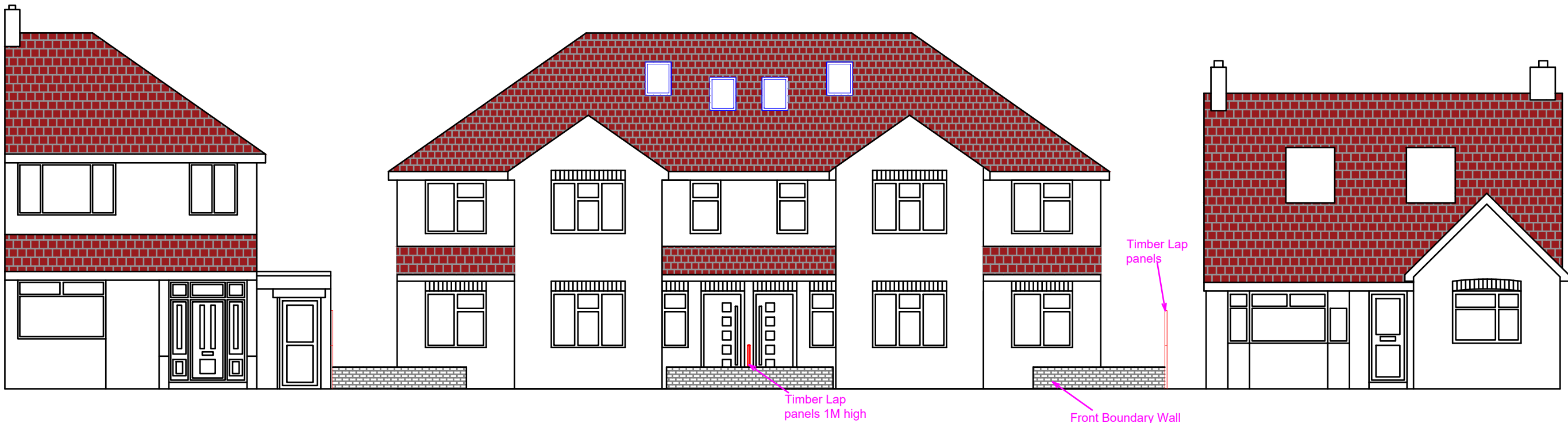
Existing Front Elevation of 76 Star Road

Note: The Drawings is for planning purpose and should not be used for construction. All dimensions should be confirmed on site and any deviation should be reported back to designer.