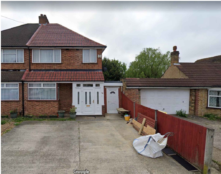
Existing Front Elevation of 76 Star Road